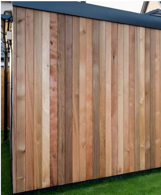
Examples of Cedar on Building