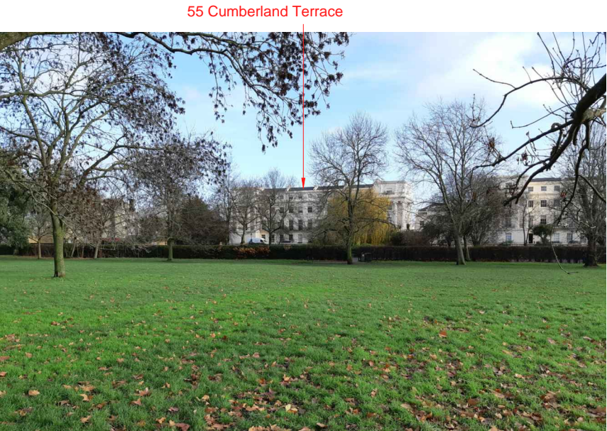
View 2, from Regents Park. Closer views are generally hidden by trees in the spring and summer months. In winter views of the roof plant would be screened by the roof ridge.