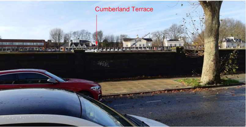
View 4, from outside 14 Mornington Terrace. A small part of Cumberland Terrace is visible but not no. 55.