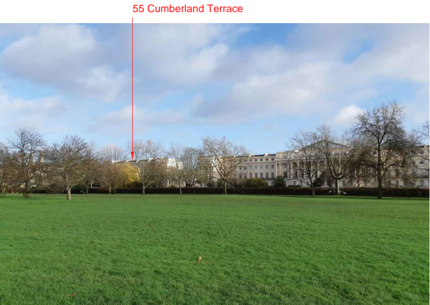
View 3, from Regents Park. Roof plant is screened by roof ridge. The view is taken 147 m from 55 Cumberland Terrace. At this distance even if the plant is visible it would be entirely peripheral to the viewer experience in Regents Park.