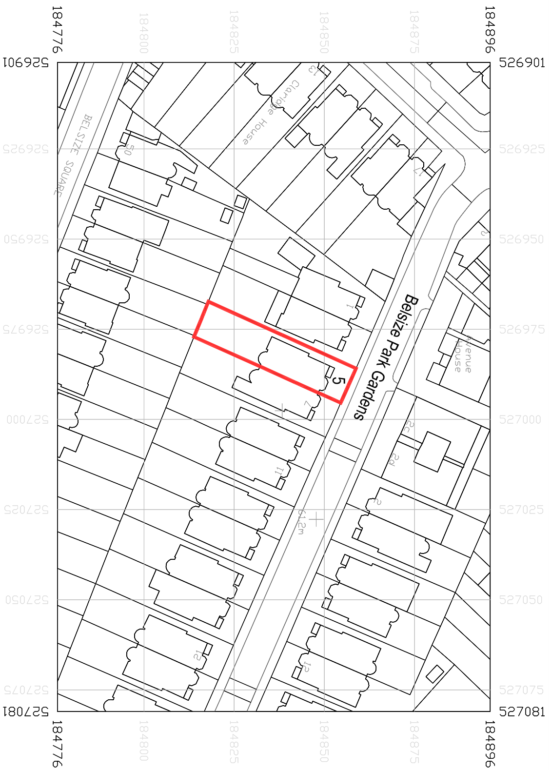
1 Site Location SCALE: 1:1000