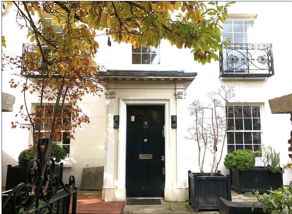
3 EXISTING - PHOTOGRAPH NTS