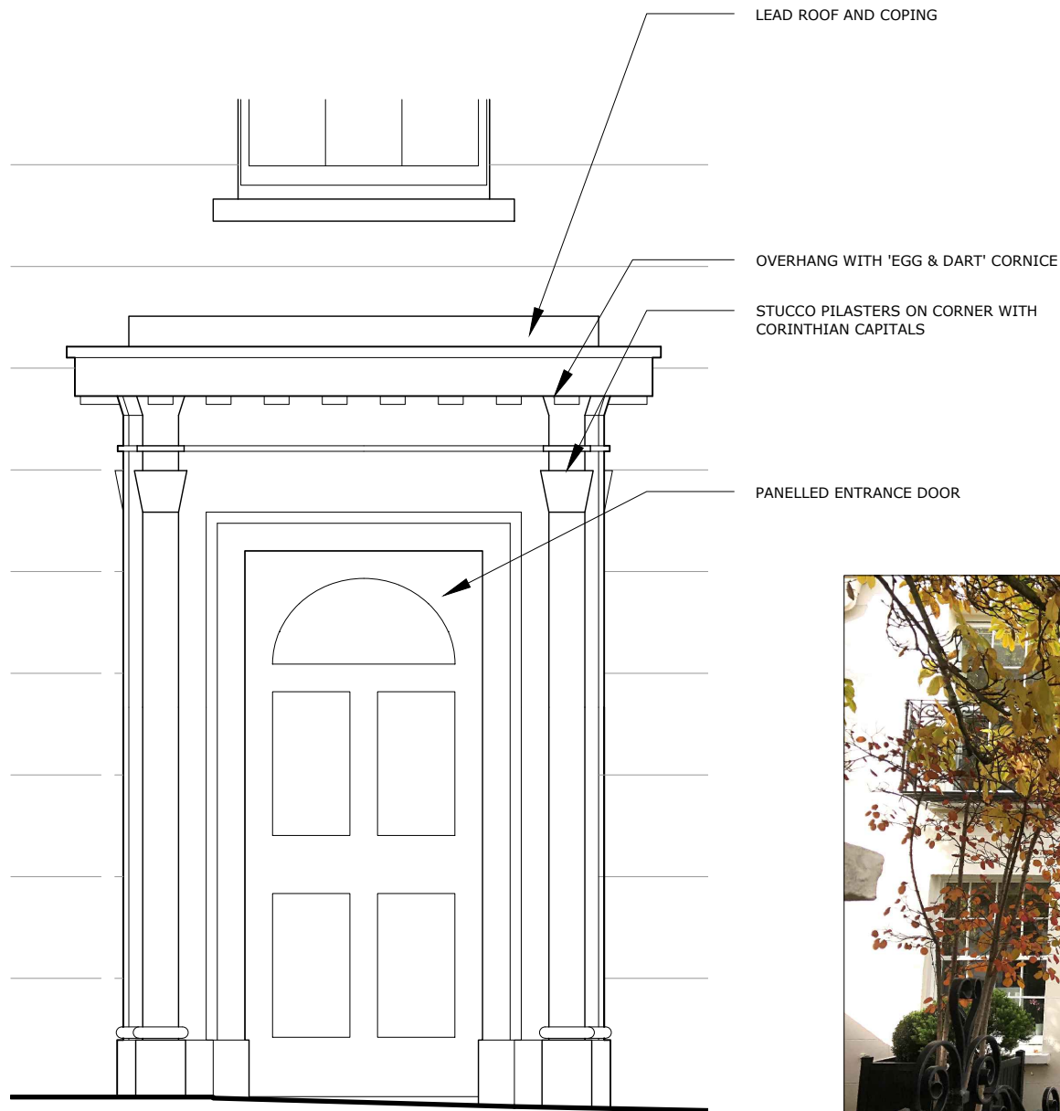
2 EXISTING PORTICO ELEVATION 1:25 @ A3