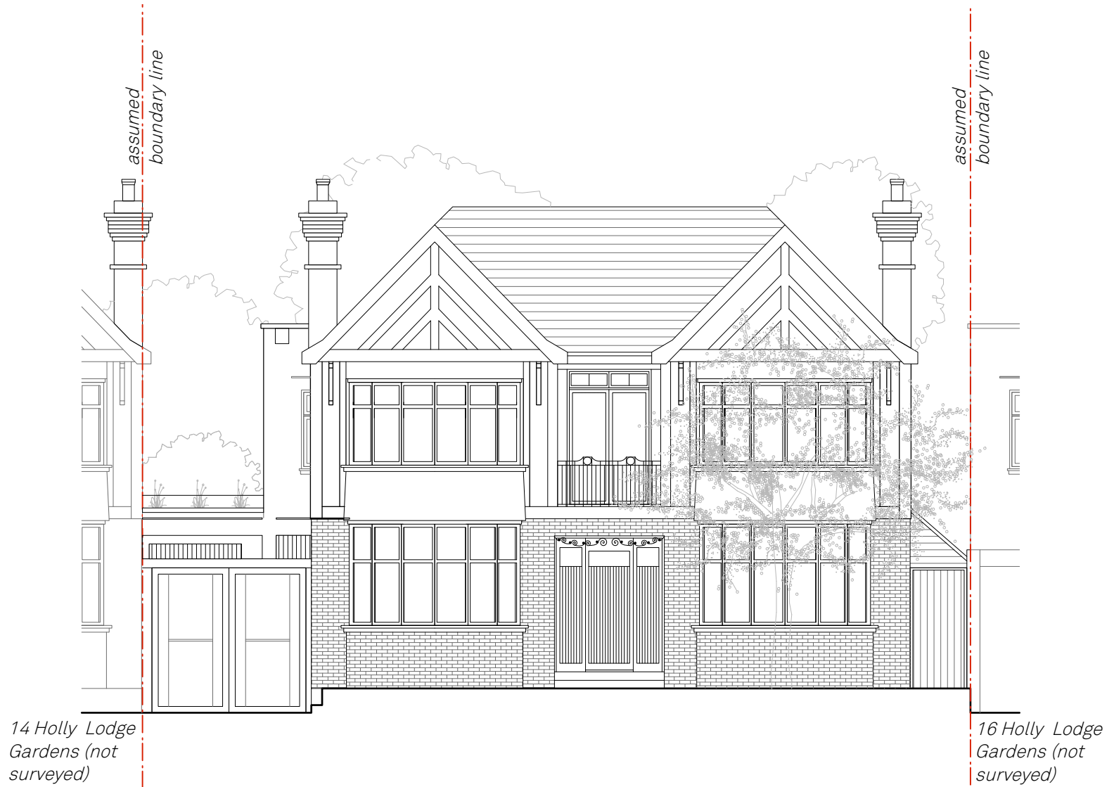
Front Elevation (to remain unchanged)