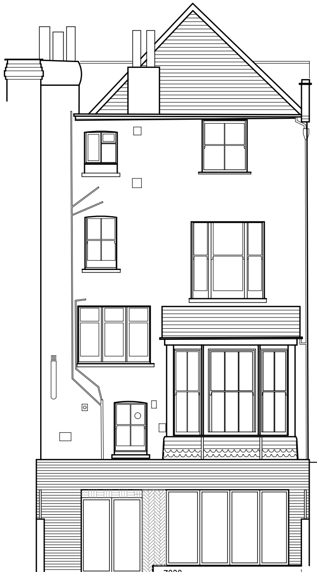
Rear Elevation (Proposed by PTA)