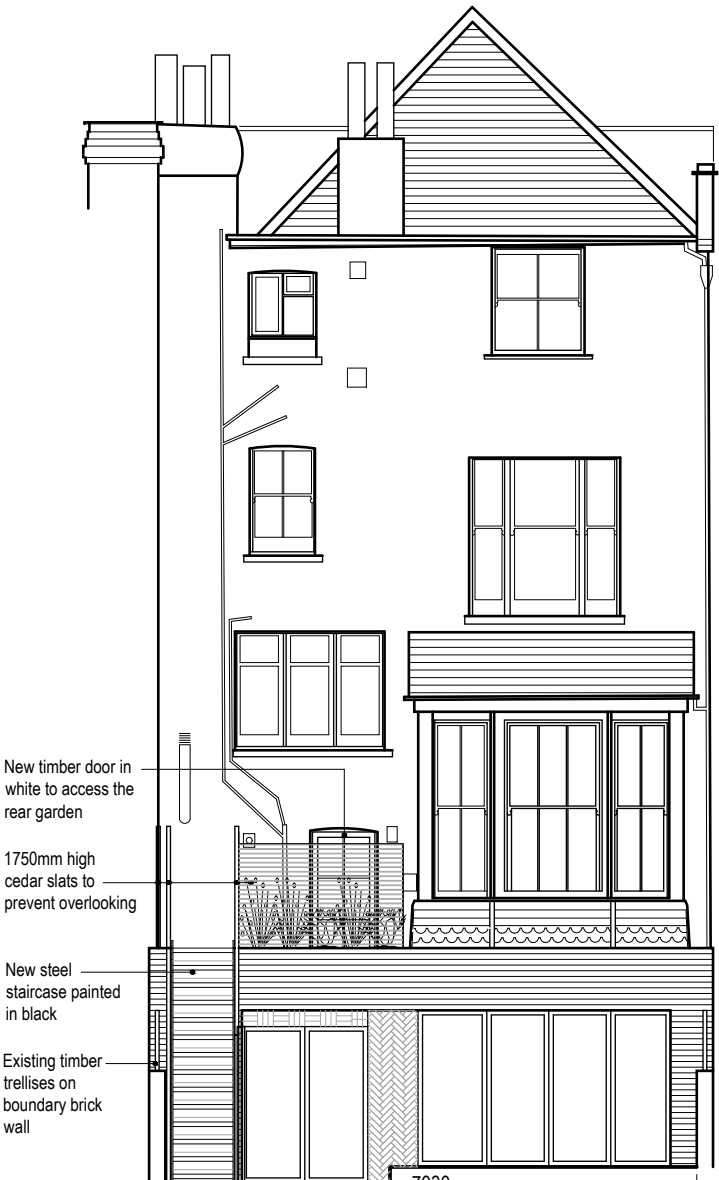
Rear Elevation (Proposed)

( Showing rear extension proposal - Application No: 2020/2879/P by PTA and proposed access staircase to rear garden by OSM )