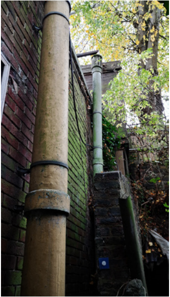
Back Lane Party Wall