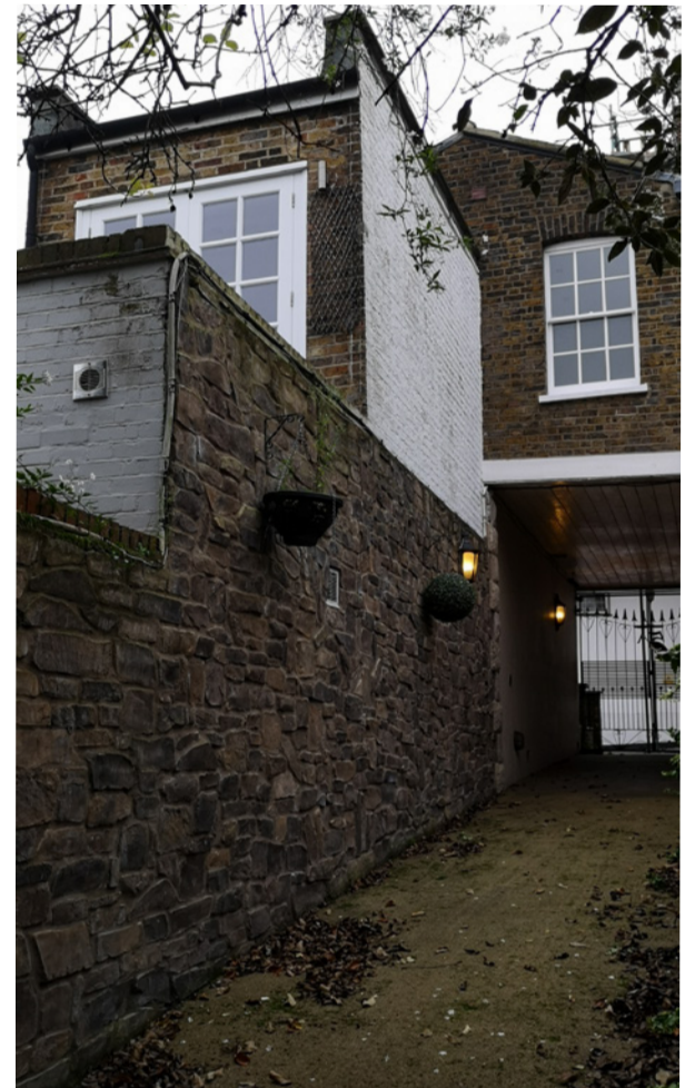
Rear of 7 Back Lane