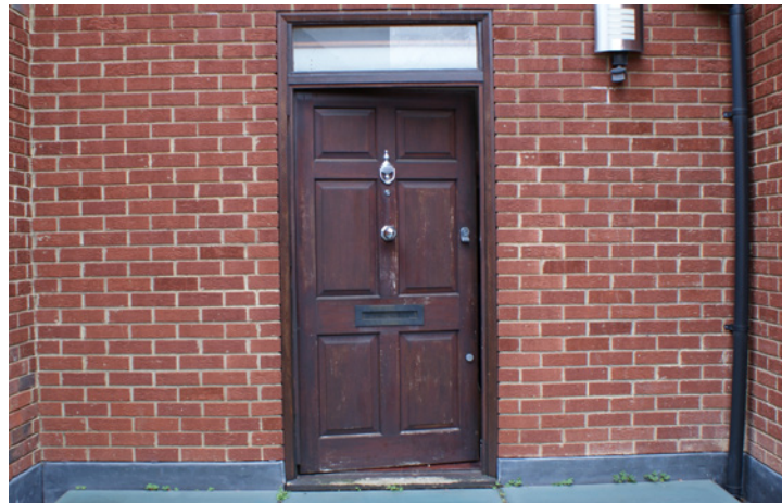
Lakis Close Front Door