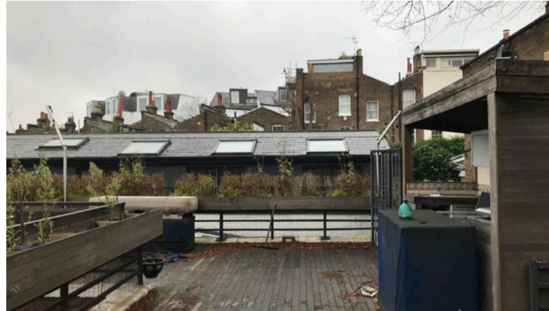
View from Terrace looking West