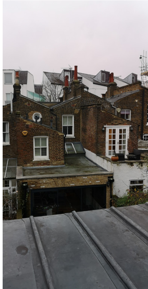
11 Back Lane