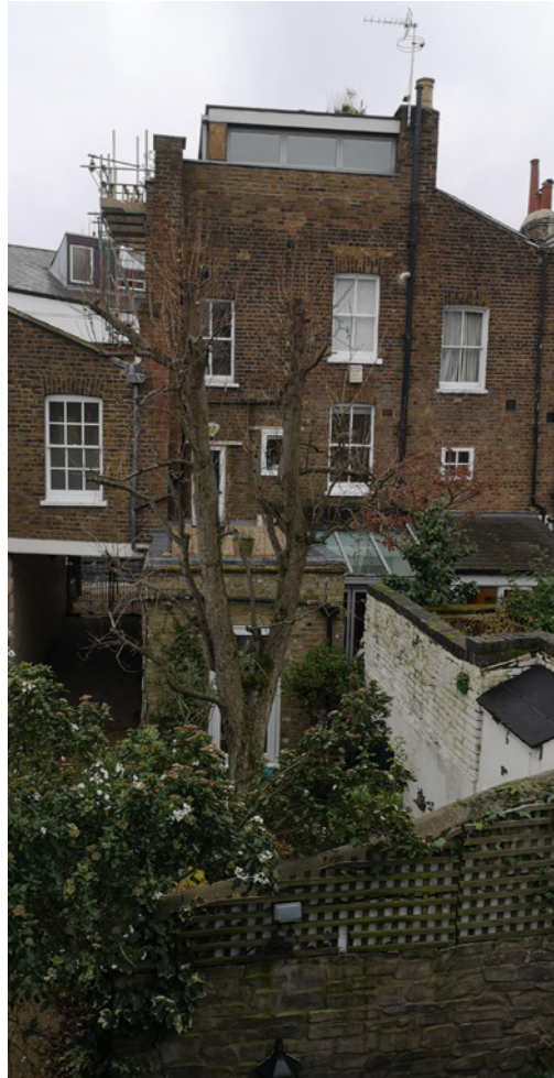
5 Back Lane