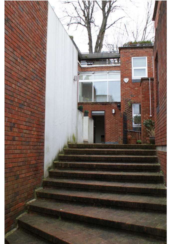
Lakis Close Approach