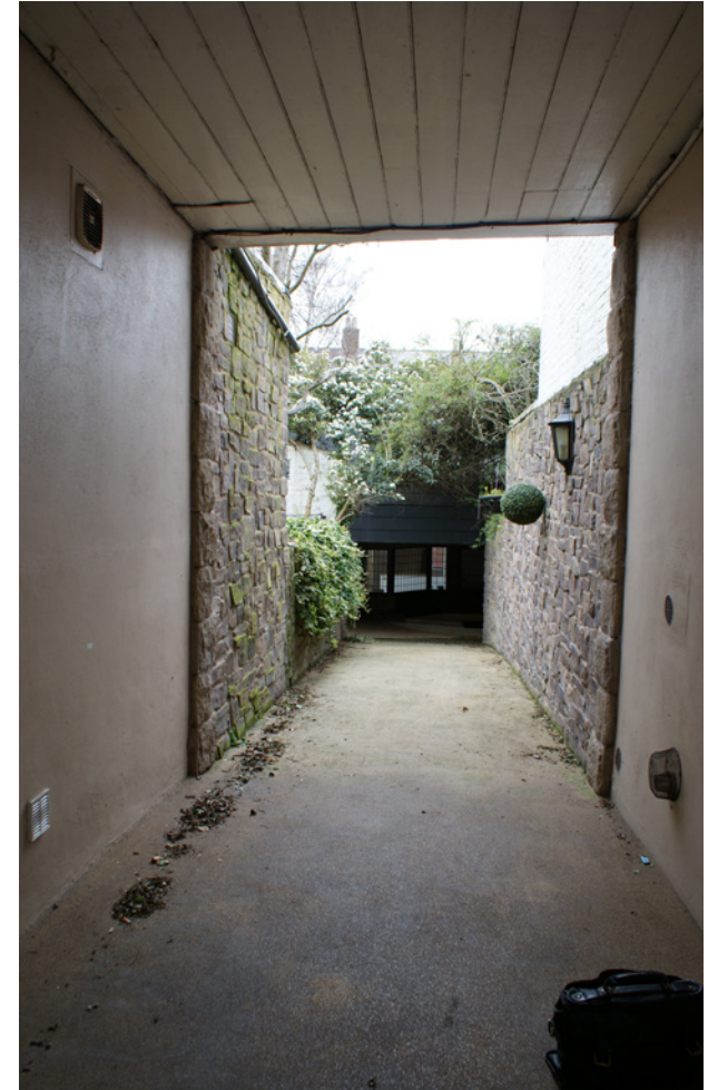
View down Driveway