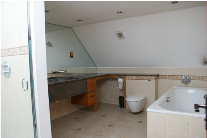
First Floor bathroom