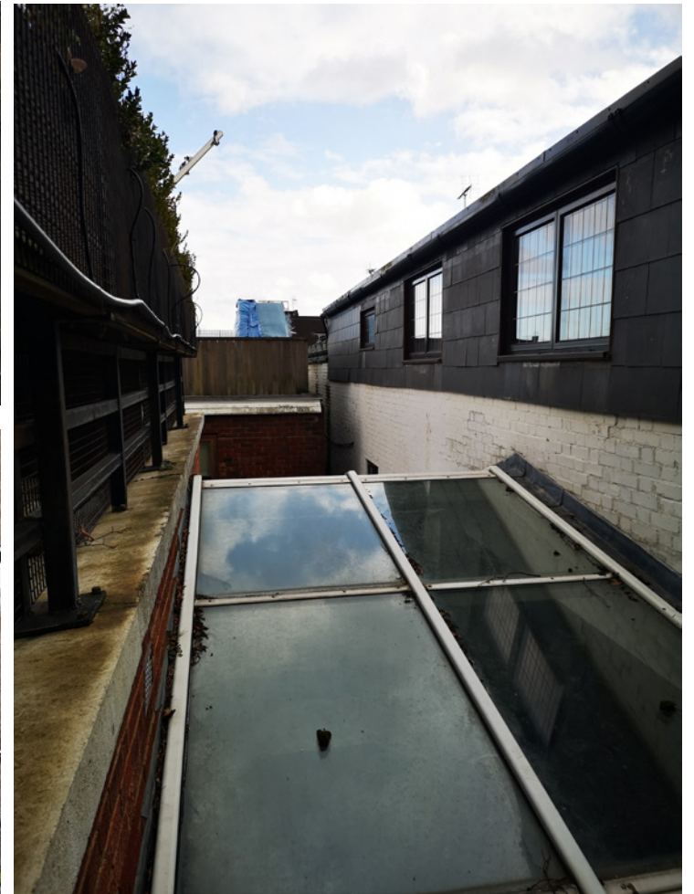
Glazed Linking Structure