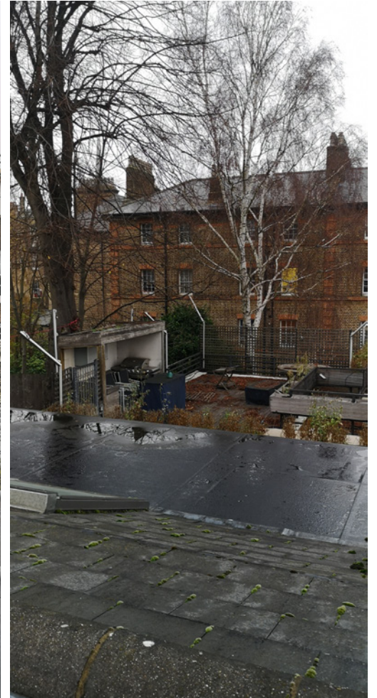
Roof Terrace + Kitchen