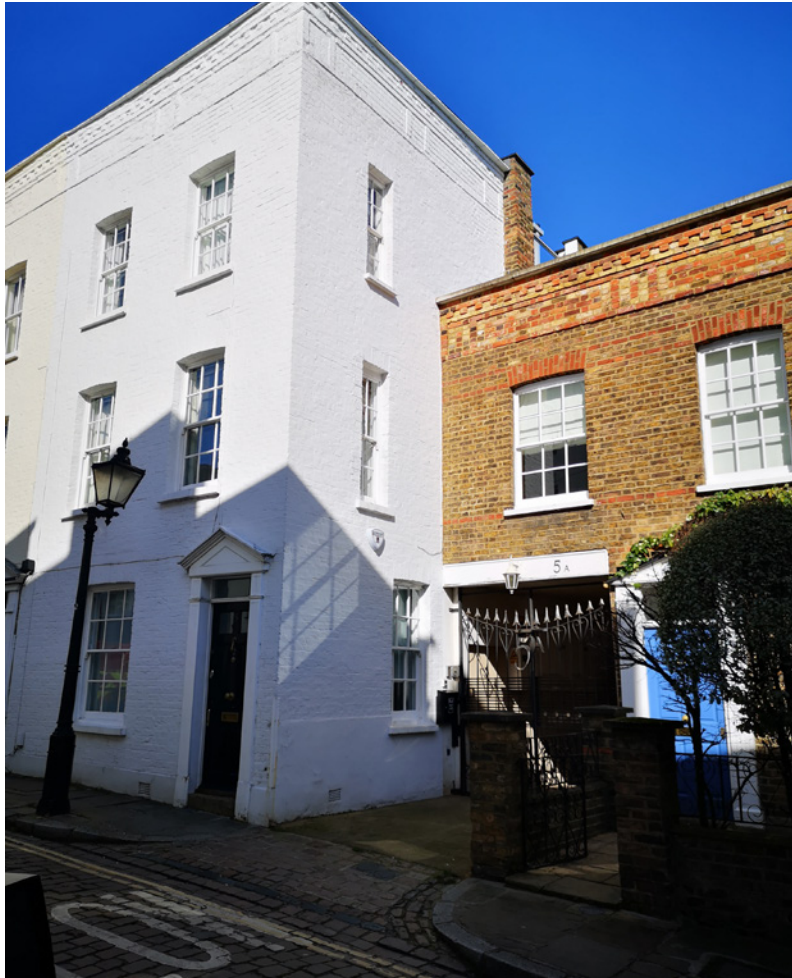
View From Back Lane