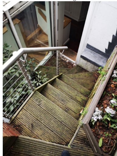
External stairs to Terrace