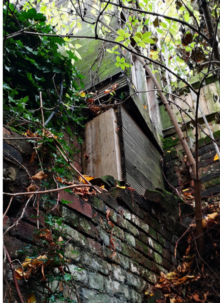
rear of Terrace Kitchen