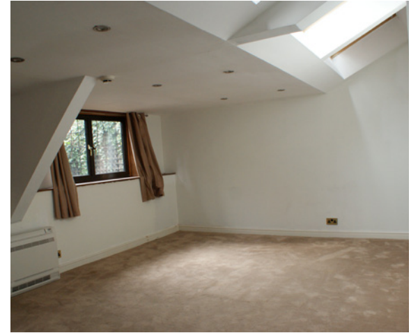
Bedroom in NW Corner of building