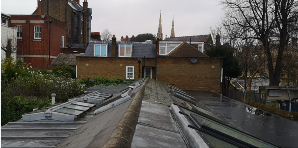
View of Streatley Place from roof