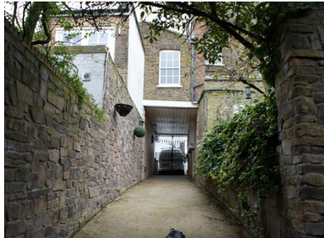
View up Driveway