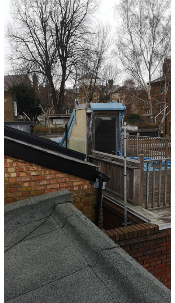
Roof of 6 Lakis Close