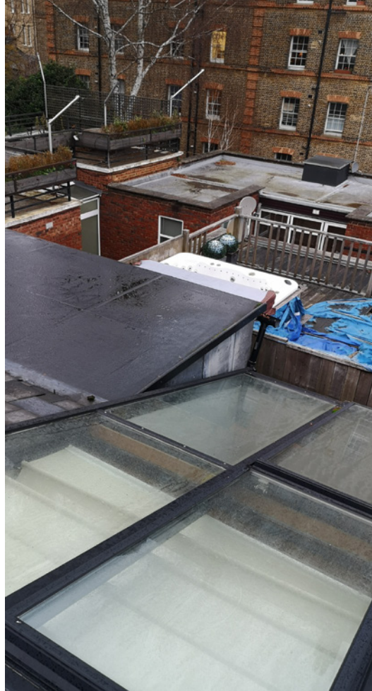
Existing Roof Light