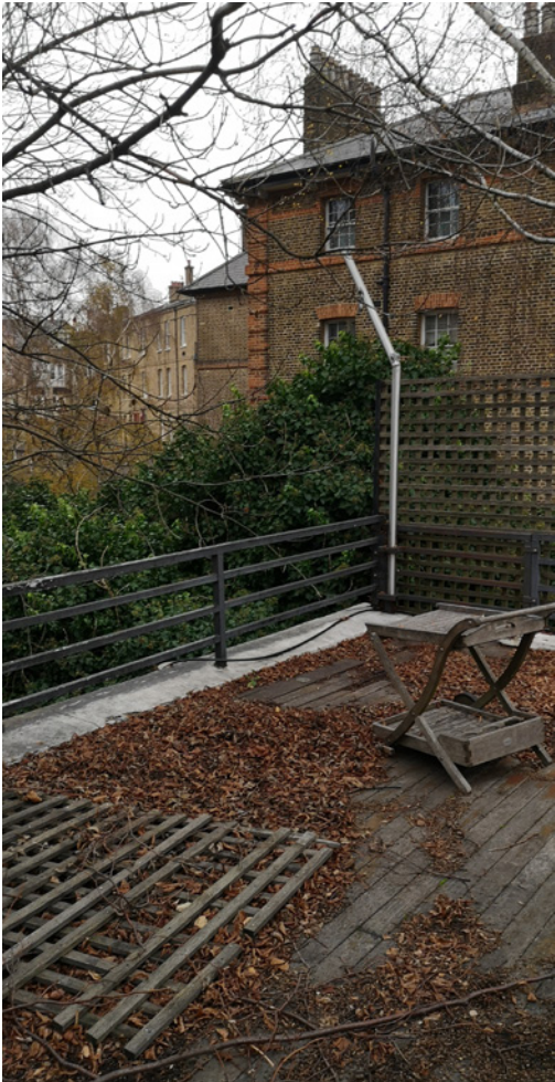
NE Corner of Terrace