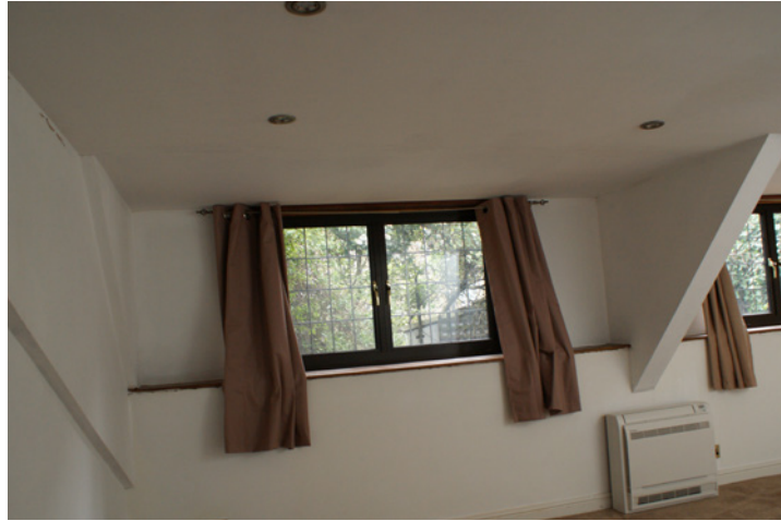
Bedroom in NW Corner of building