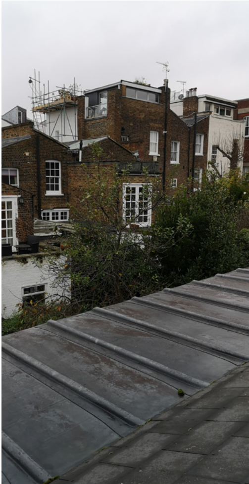
5 Back Lane