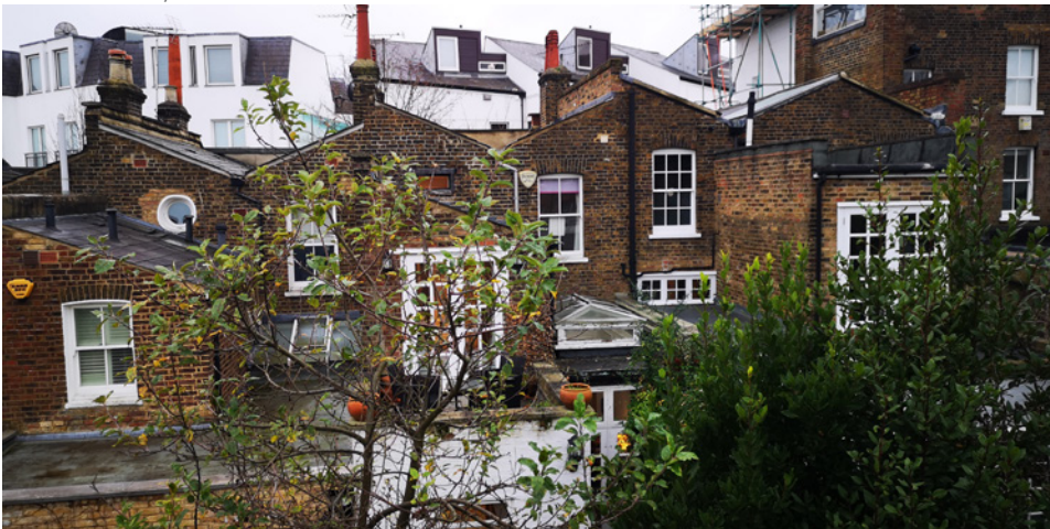
Back Lane Rear Elevation No.5 to Right