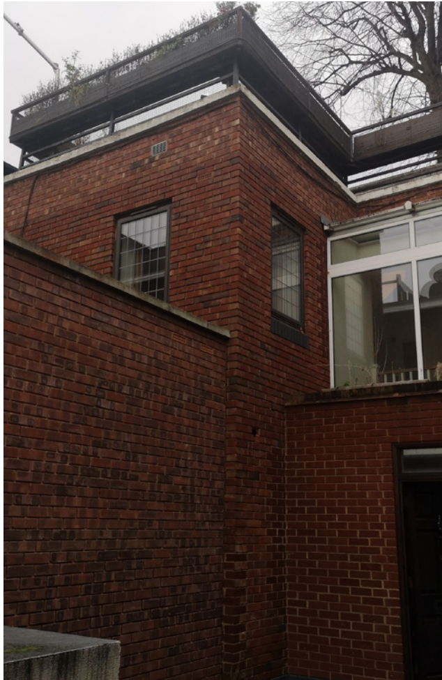
Lakis Close Windows