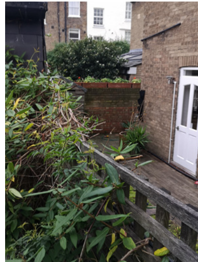
rear of 3 Streatley Place