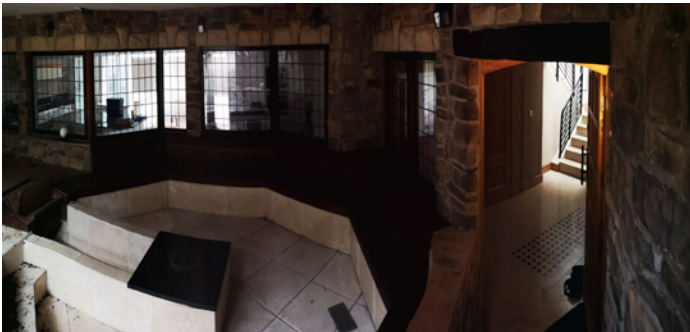
Front door back Lane