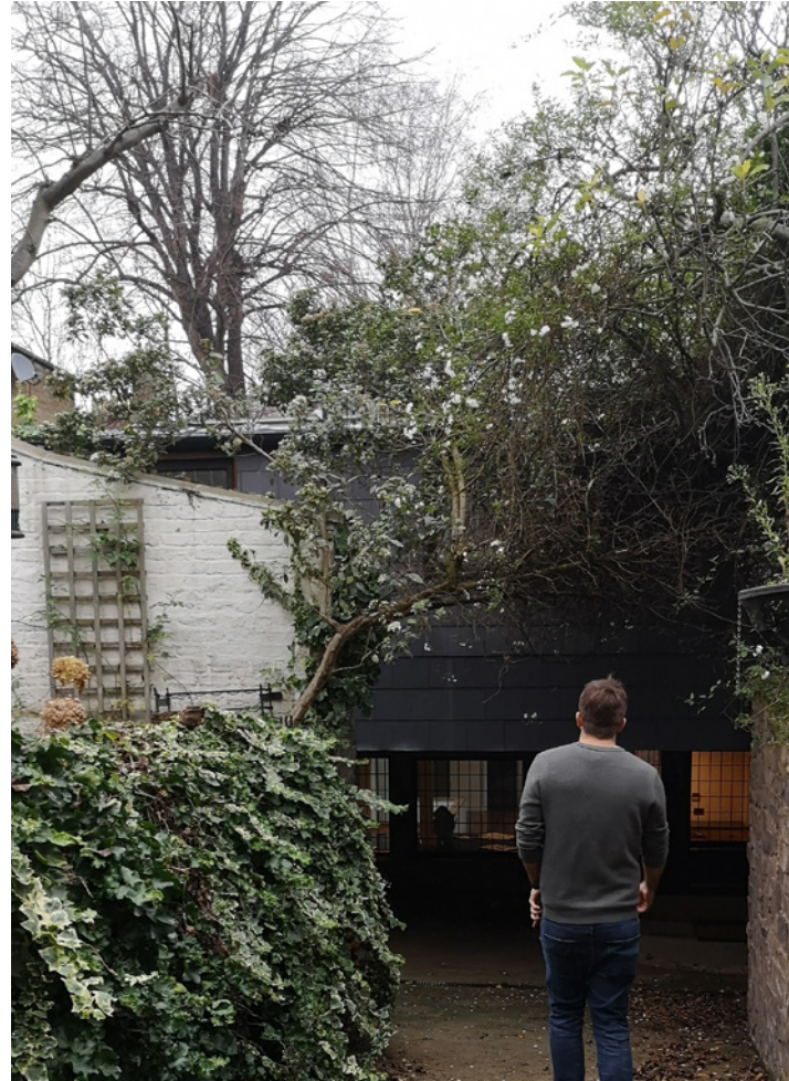
View down Driveway