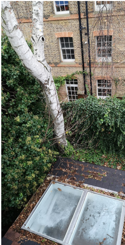
Existing Extension and Tree