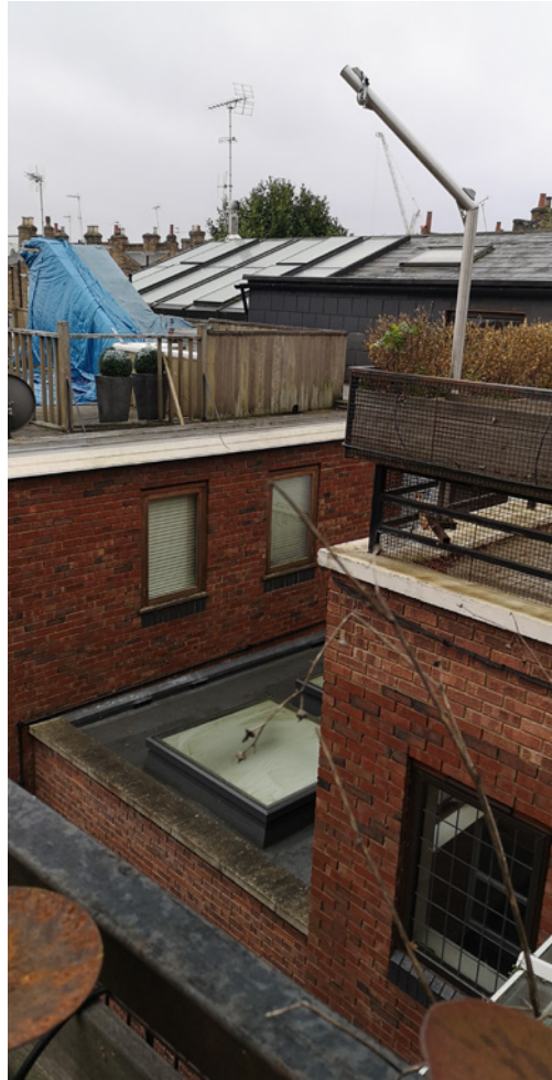
Roof of 6 Lakis Close