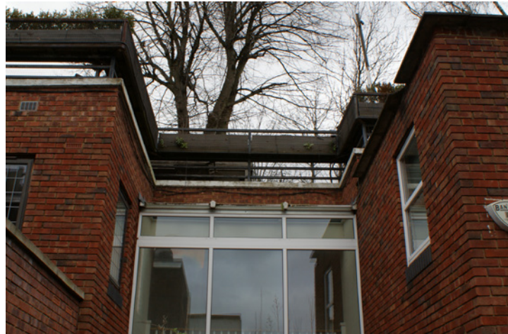
Glazing above Door