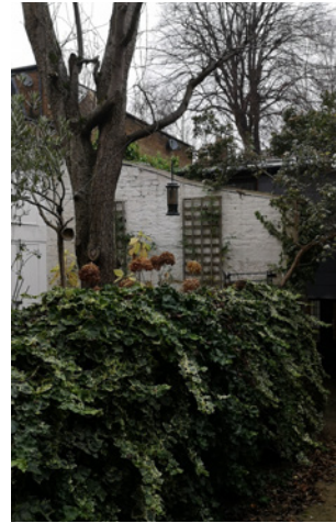
5 Back lane Garden