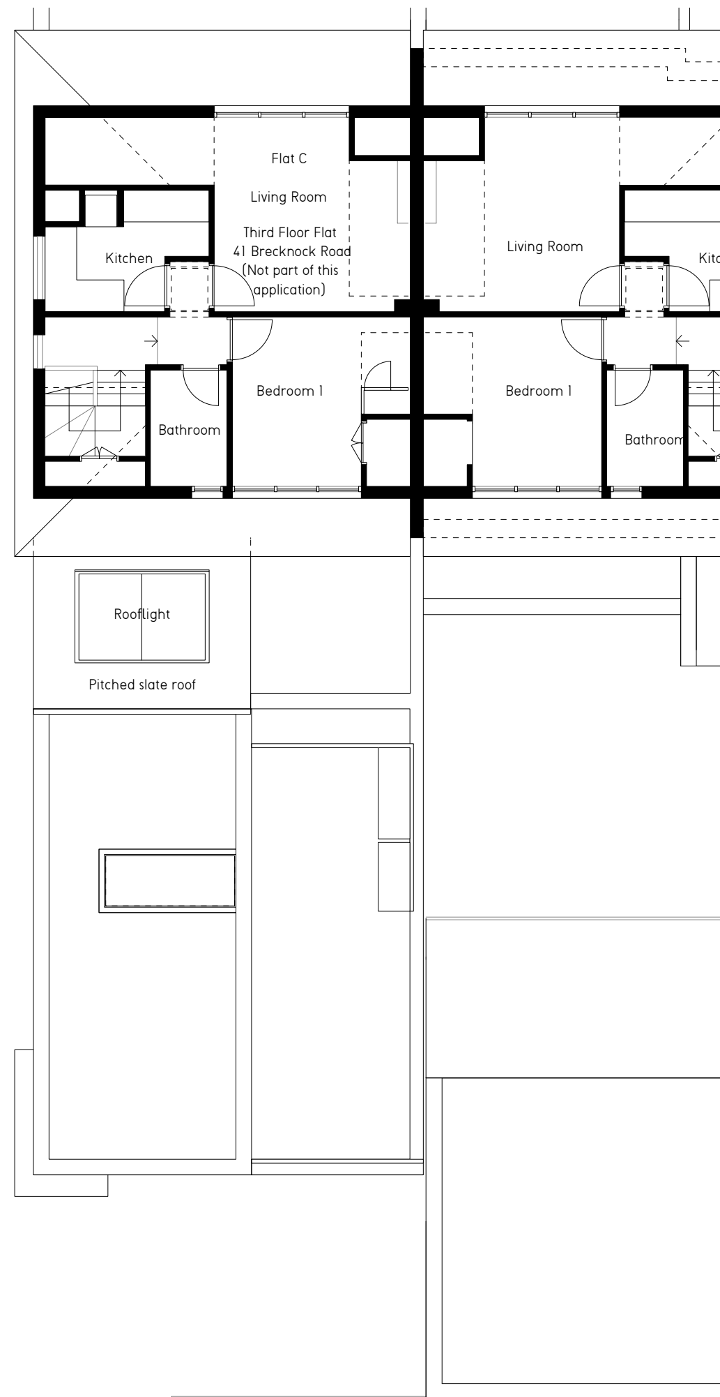
02 | Fourth Floor / Roof Plan (Not part of this application)