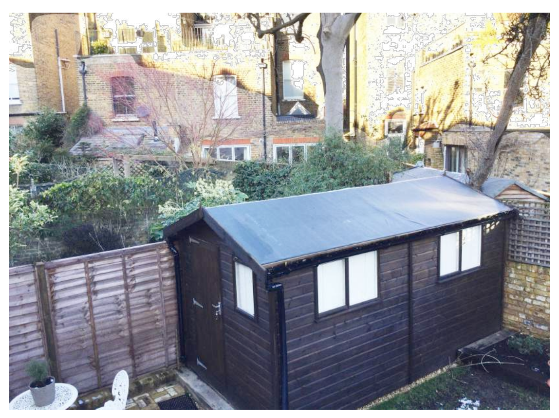
view of shed (as built)