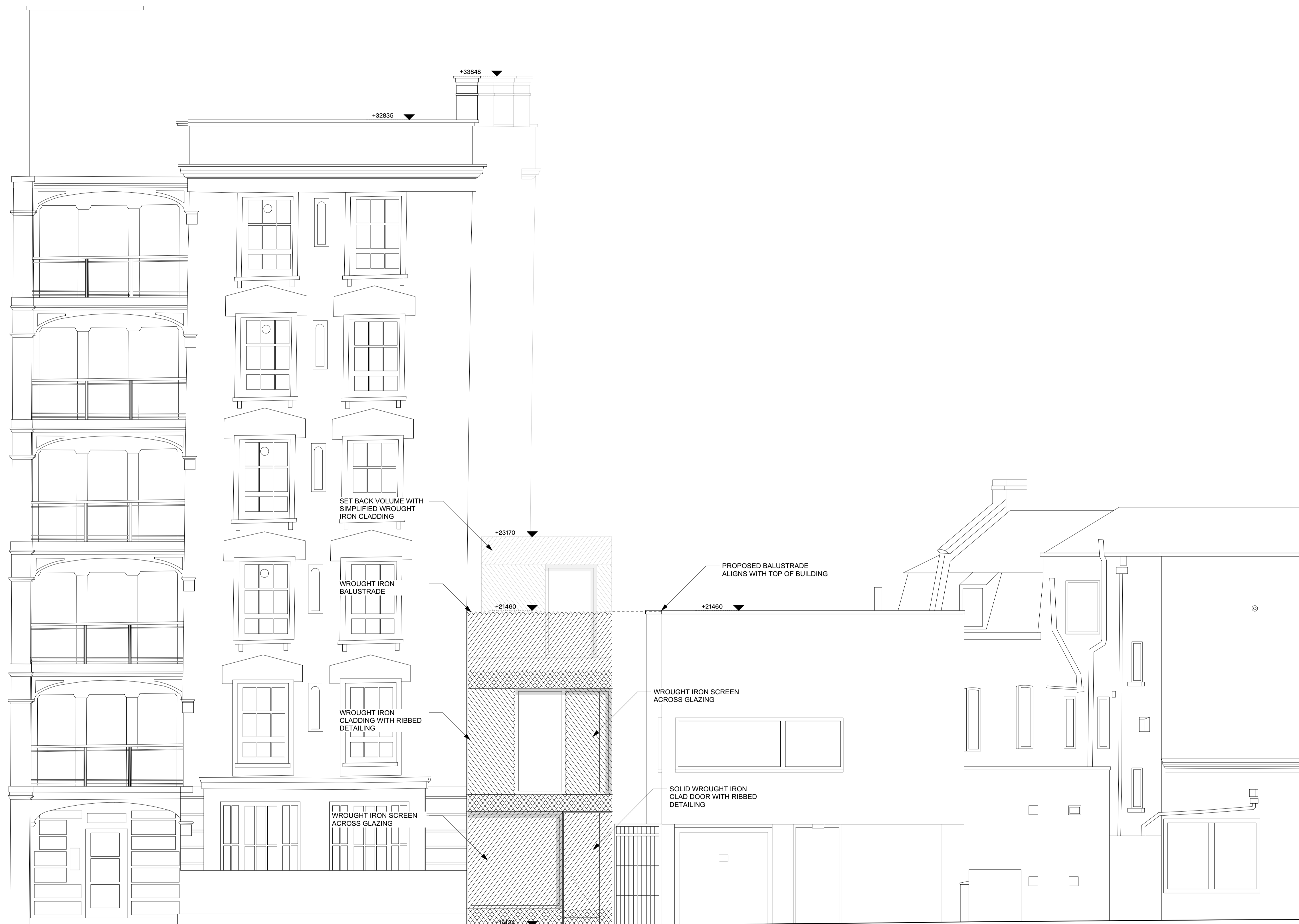
1 Proposed South Elevation Scale: 1:50