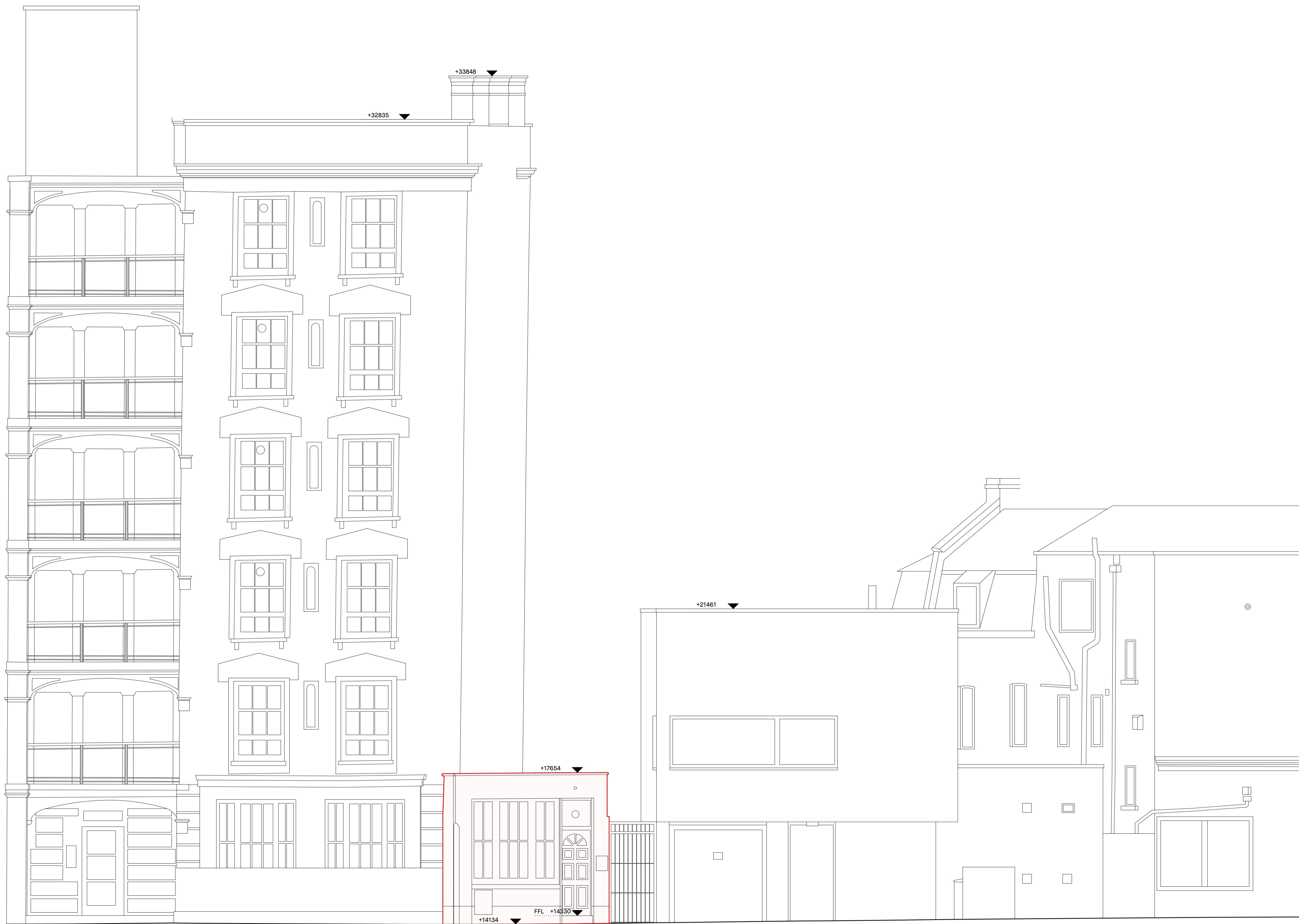
1 Existing South Elevation Scale: 1:50