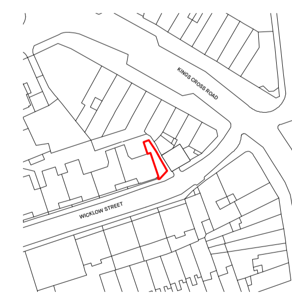
2 Location Plan Scale: 1:1250