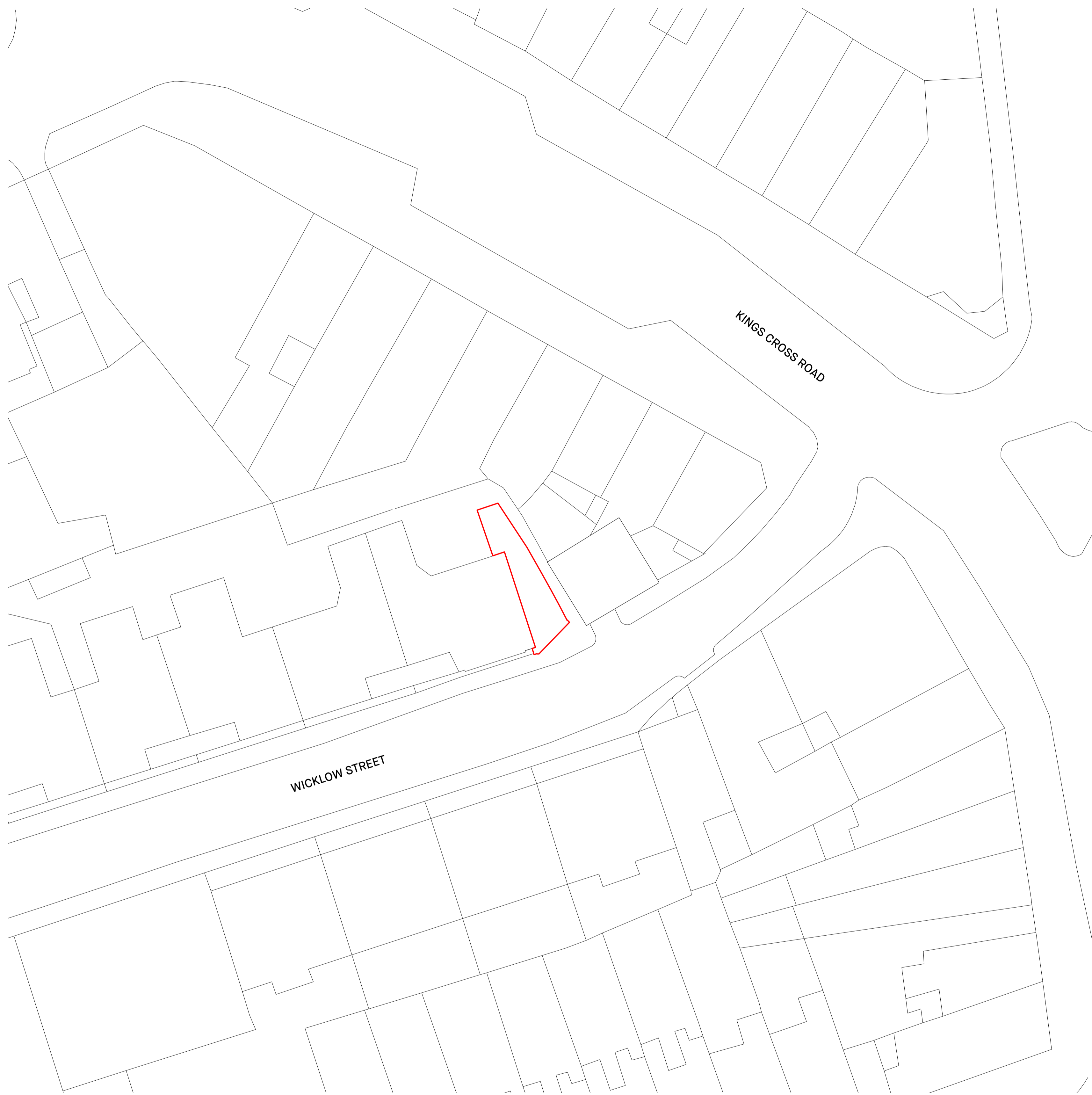
1 Site Plan Scale: 1:200