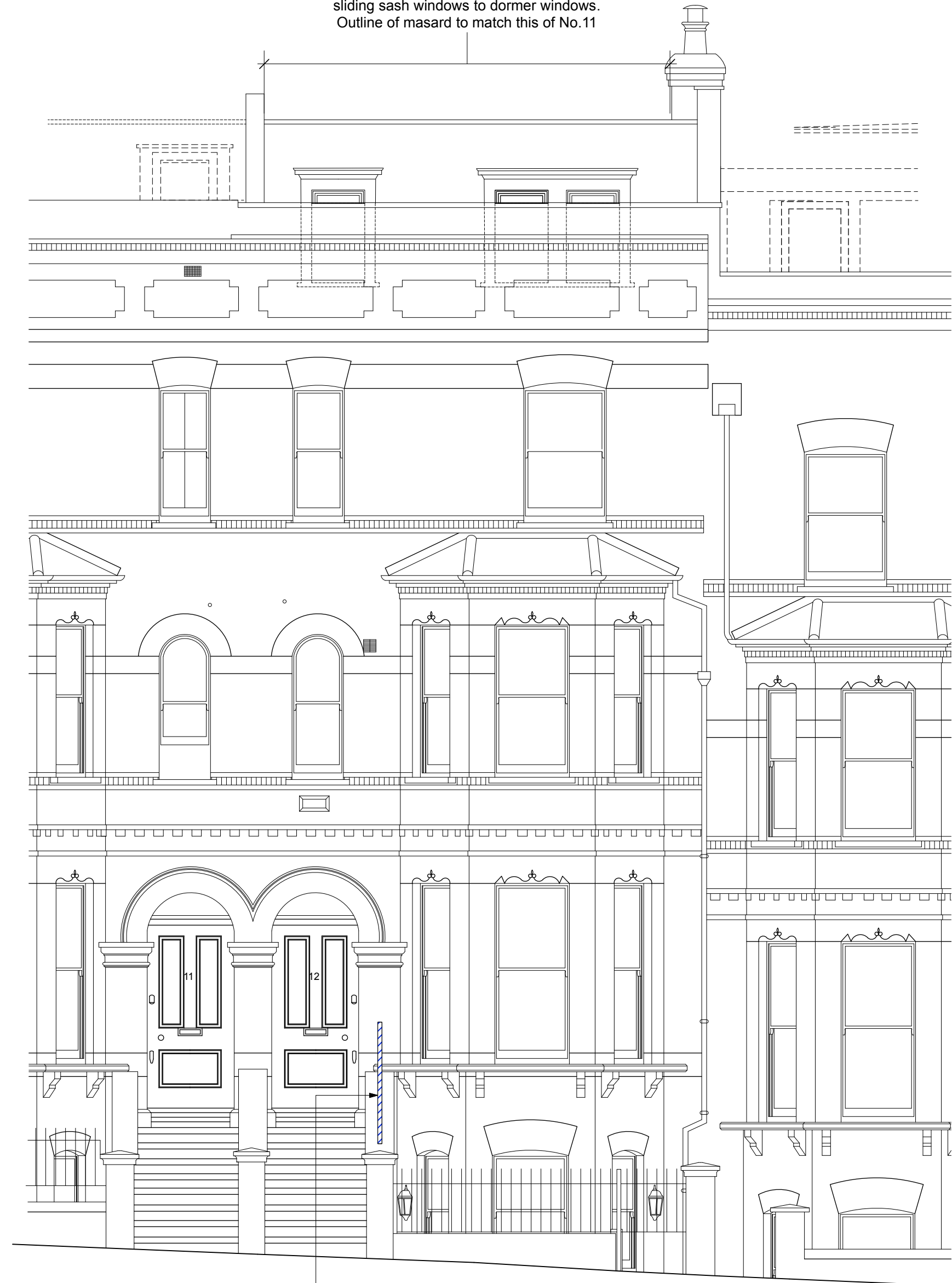
2 Proposed South East Elevation Scale: 1:50

New mansard roof with Bauder type bitumen roof covering to flat roof and natural Welsh slate tiles to mansard walls. Dormers with painted timber fronts, lead cheeks and roof. New double glazed painted timber sliding sash windows to dormer windows. Outline of mansard to match this of No.11