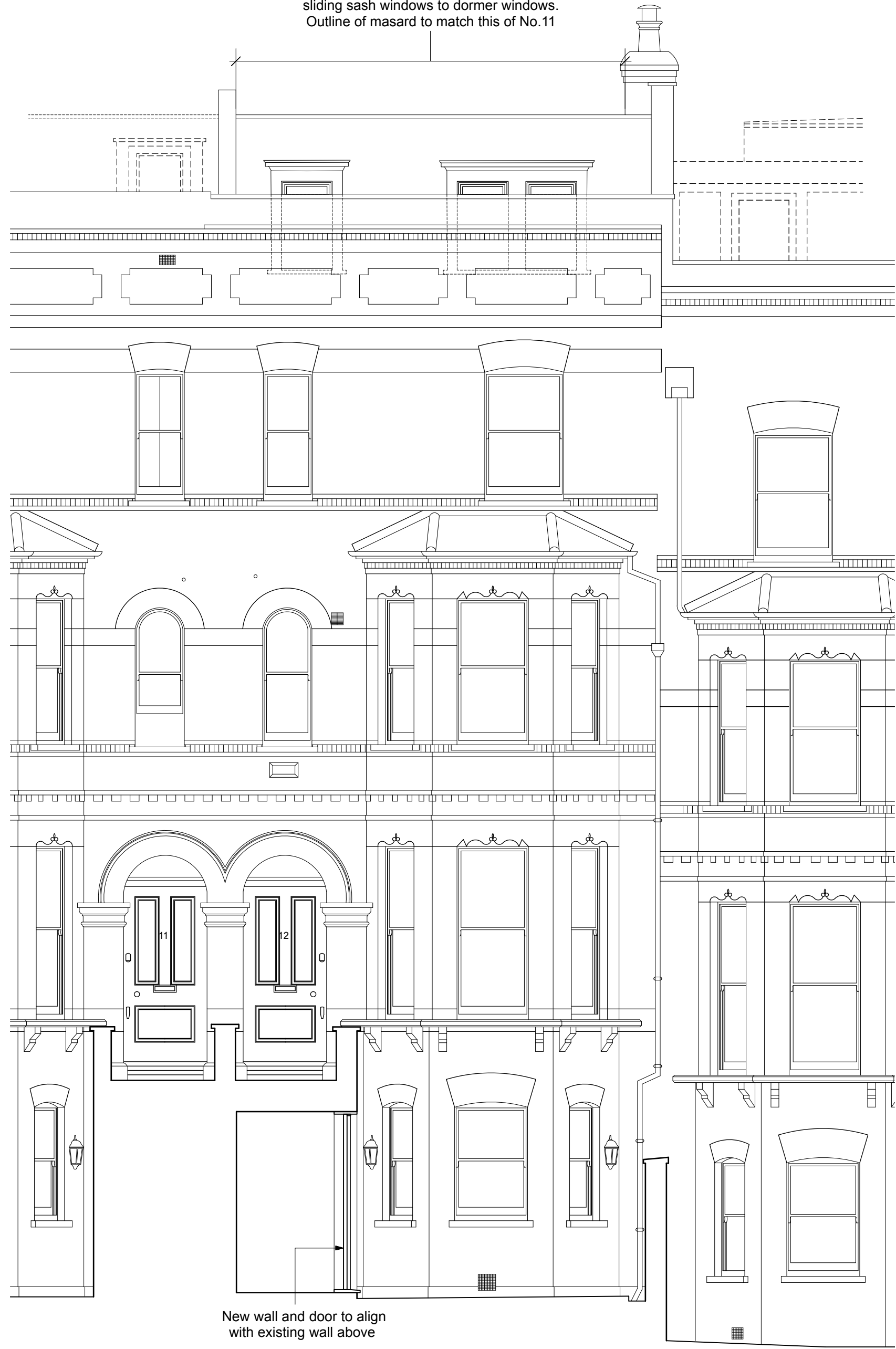
1 Proposed South East Elevation / Section Scale: 1:50

New mansard roof with Bauder type bitumen roof covering to flat roof and natural Welsh slate tiles to mansard walls. Dormers with painted timber fronts, lead cheeks and roof. New double glazed painted timber sliding sash windows to dormer windows. Outline of mansard to match this of No.11