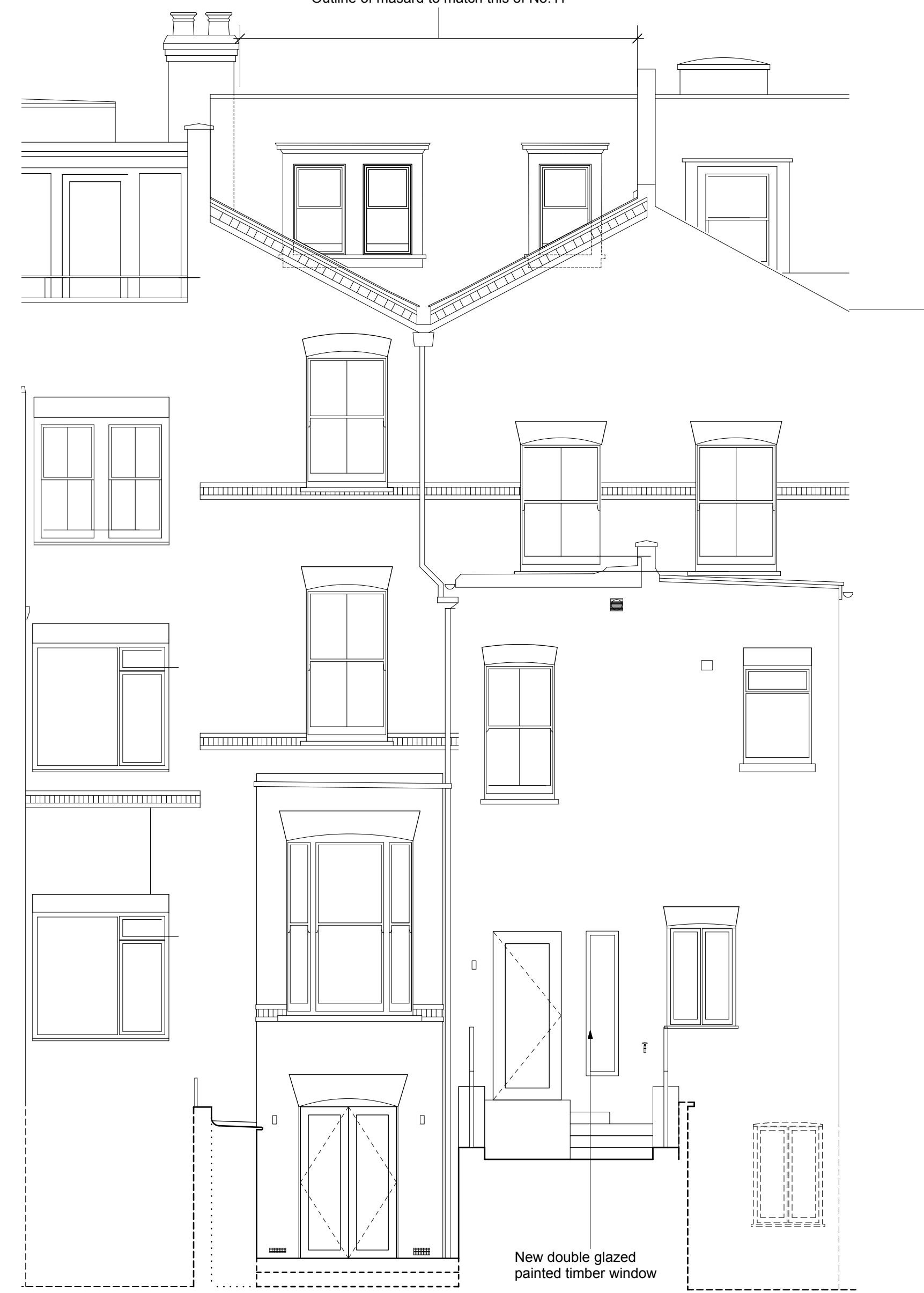
3 Proposed North West Elevation Scale: 1:50

New mansard roof with Bauder type bitumen roof covering to flat roof and natural Welsh slate tiles to mansard walls. Dormers with painted timber fronts, lead cheeks and roof. New double glazed painted timber sliding sash windows to dormer windows. Outline of mansard to match this of No.11