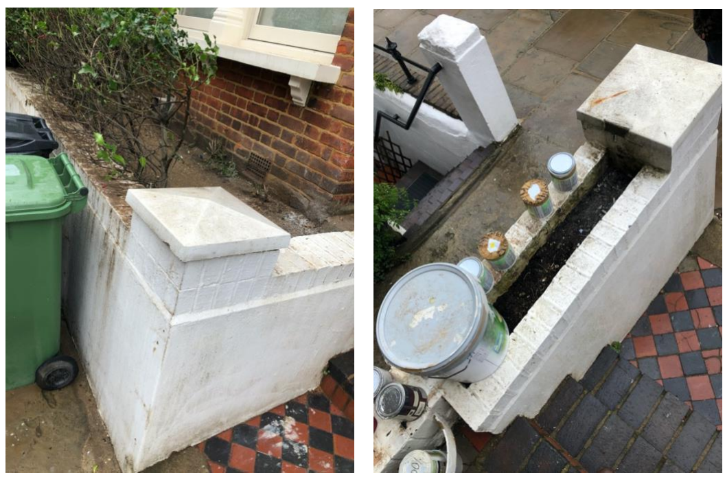
4. Existing site.