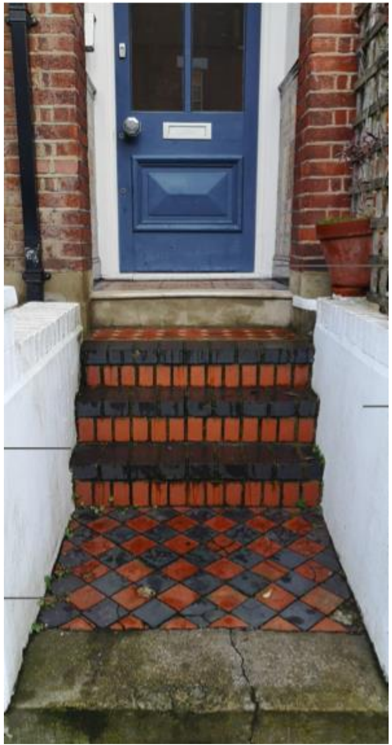
1. Existing Site: front door, glazing and steps arrangement