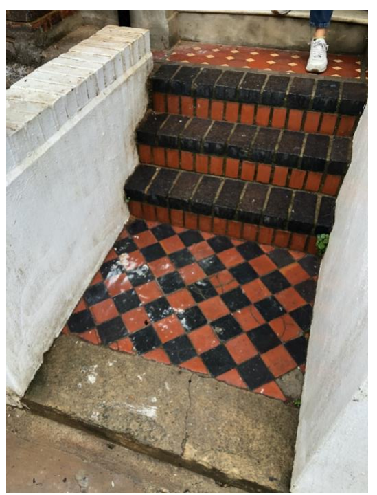
6. Existing site: front steps and landings.