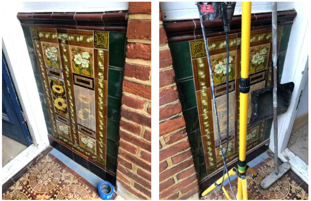
7. Existing site: porch tiles and top landing tiles