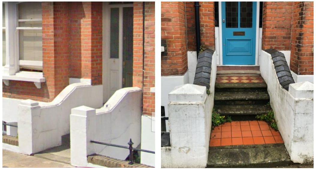
5. Off site: In the same context as the site, located east.