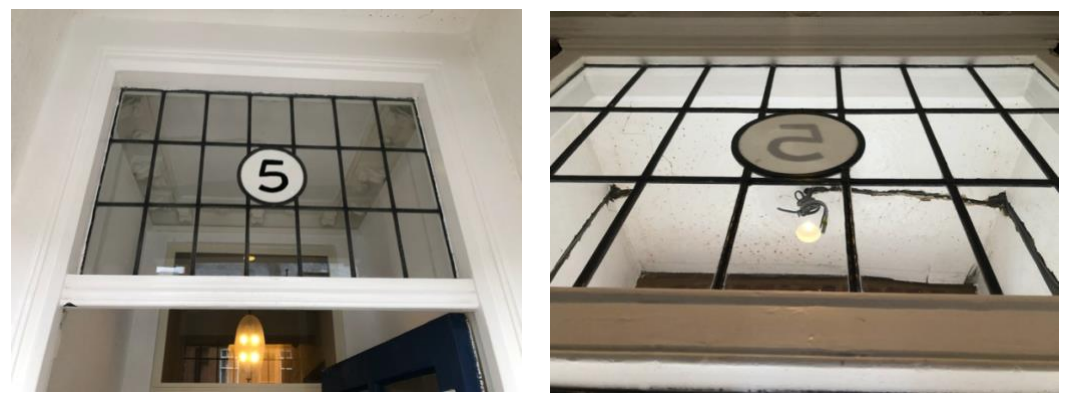
3. Existing site: Door number as part of lead glass fan light (inside and outside).