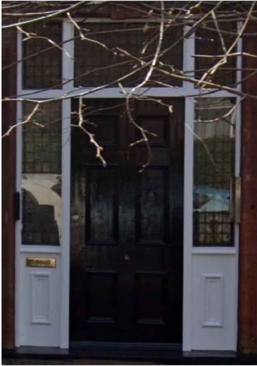
PROPOSED REPLACEMENT GLAZING (TAKEN FROM 60 COMPAYNE GARDENS)