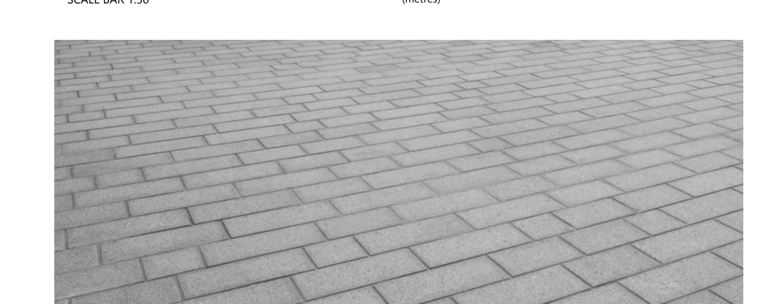
PROPOSED GRANITE DRIVEWAY

Crop marks are visible when the full extent of this drawing is plotted Reference dimensions: 820mm from the crop mark to right of tile block & 570mm between crop marks vertically