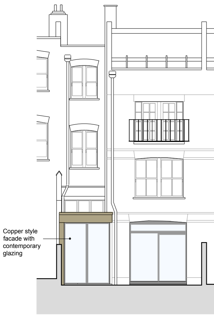
PROPOSED ELEVATION 0 1 5m