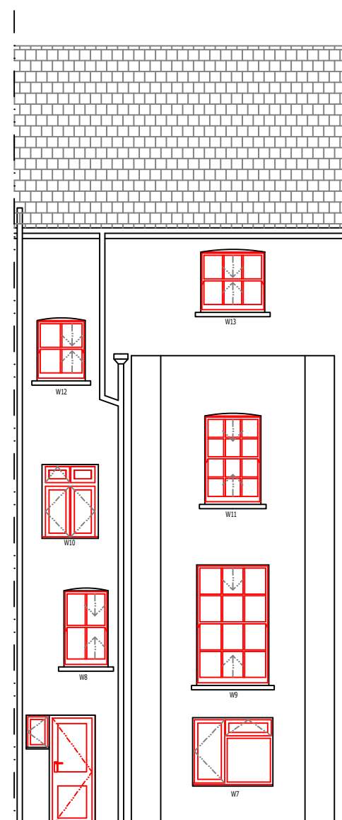
85 AGAR GROVE PROPOSED REAR ELEVATION VIEW B - 1:100