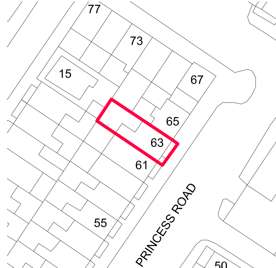
2 Site Plan 1:500 @ A3