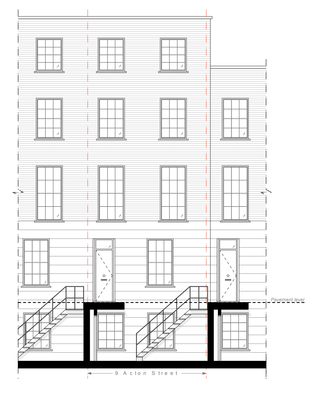
Front Elevation - through lightwell