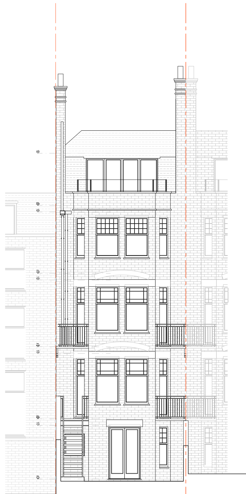
02 Existing Rear Elevation 1:100 @A3