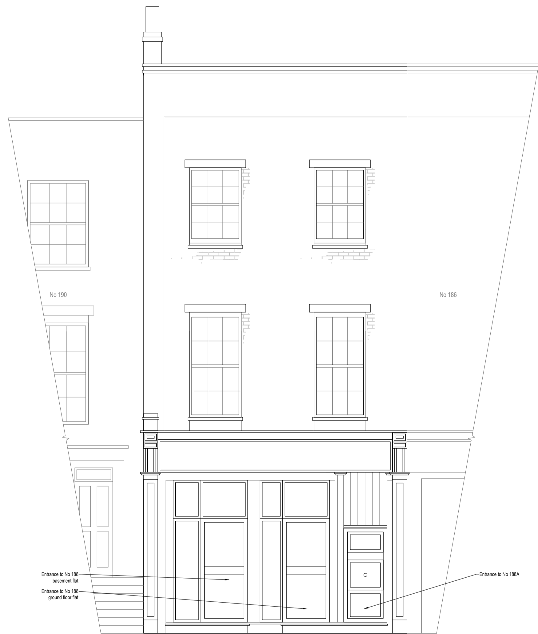
Existing ground floor frontage

NOTE: The general contractor is responsible for the verification of all dimensions on site and shall inform the contract surveyor of any discrepancies. Do not scale from the drawing. Use figure dimension only. Existing foundations, inlets and walls to be exposed if required by building control for assessment and upgrading if found inadequate. Drawings copyright of Control Zed Design. Drawings to be used for stated purpose only. Note all drawings to be read in conjunction with engineers drawings. If there are any queries contractor to contact surveyor immediately. All stair dimensions are to be confirmed by installer prior to installation and any discrepancies to be brought to the attention of the surveyor. This drawing is for negotiations with the Local Authority Planning & Building Control departments. In the event that it is used for construction then the builder is responsible for checking on site all dimensions and relevant information prior to the commencement of works to ensure the accuracy of any information contained in the drawing. Any discrepancy must be notified before work commences. The drawing may only be used for the address shown and may not be copied without permission. These drawings are Copyright controlled. The final position of all walls and projections in relation to boundary must be agreed between building owners prior to any works carried out on site. All boundaries shown on the drawings are for illustration purposes only.