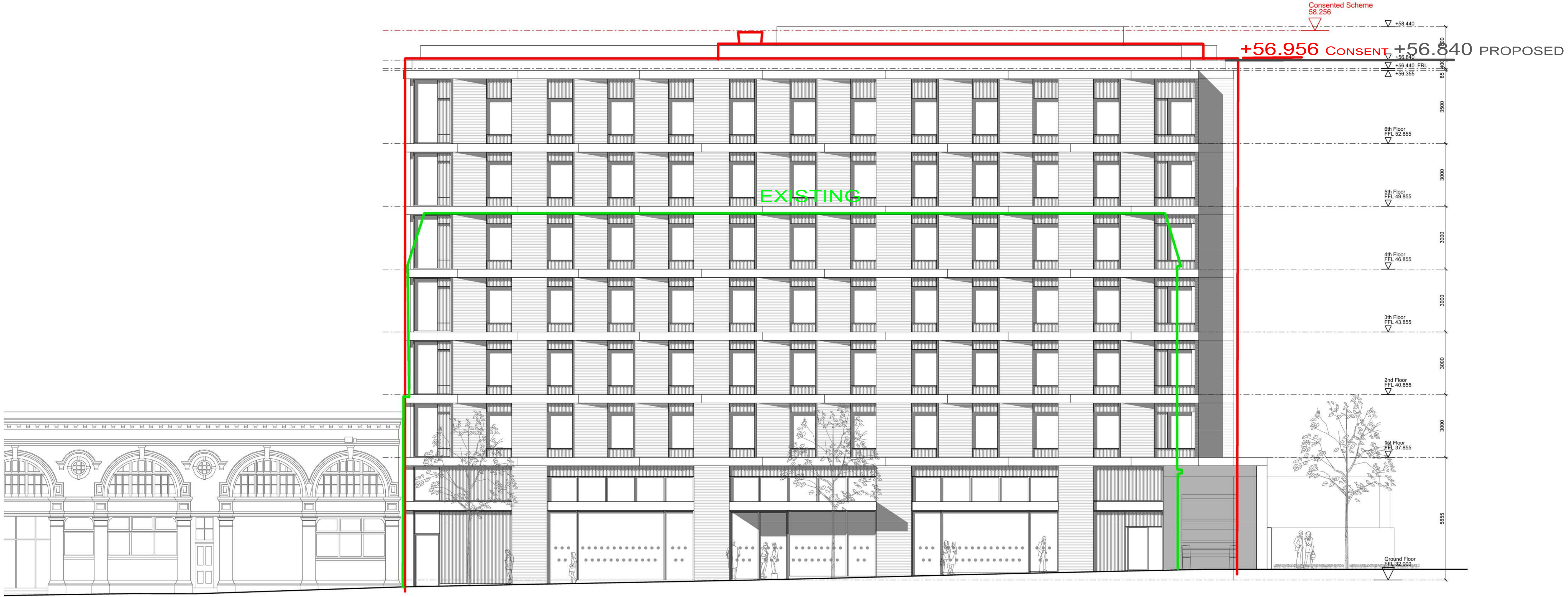
COMPARISON OF PROPOSED CONSENTED AND EXISTING MASSING HAVERSTOCK HILL ELEVATION 27 JANUARY 2021