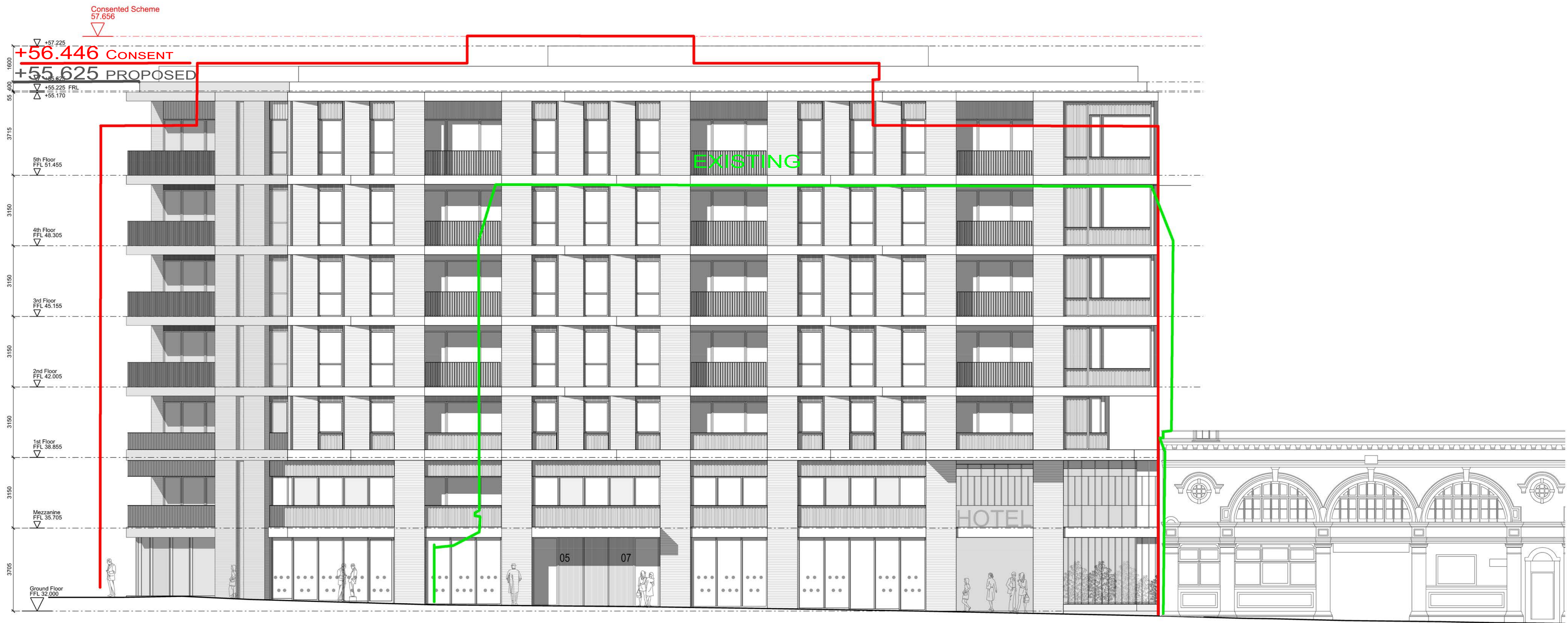
COMPARISON OF PROPOSED CONSENTED AND EXISTING MASSING ADELAIDE ROAD ELEVATION 27 JANUARY 2021