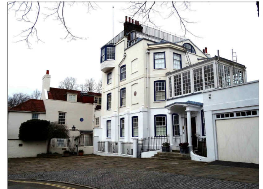
REAR DORMER REFERENCE The Admirals House NW3 Rear dormer reference.