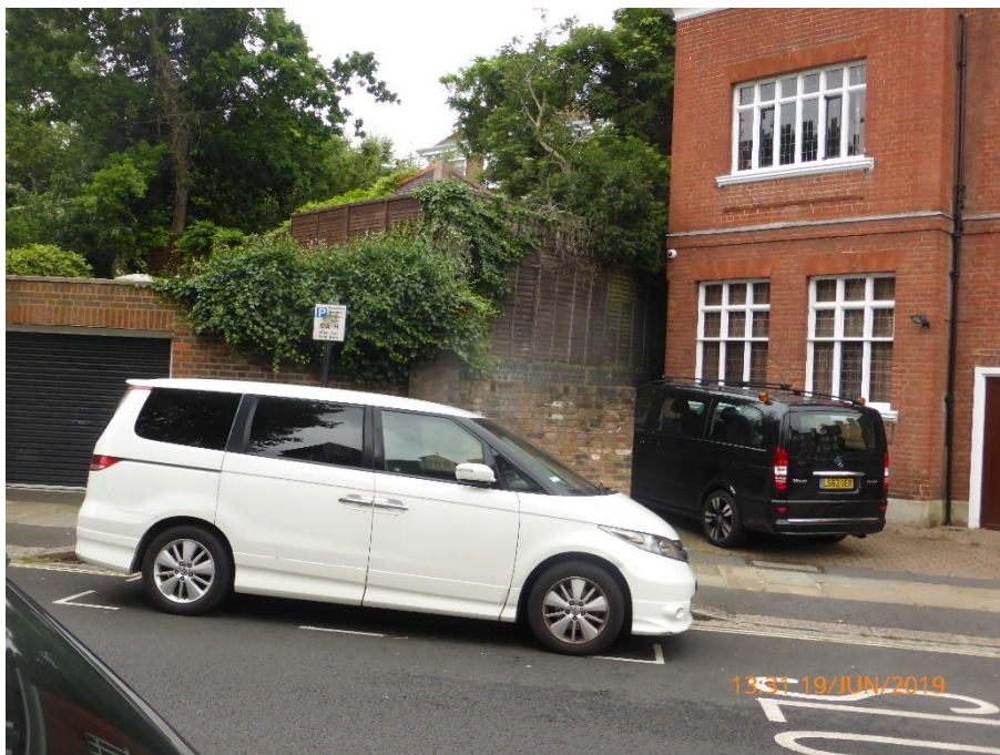
View of neighbour's wall – note the remoteness of the neighbour's retaining wall to the left side wall of the garage.