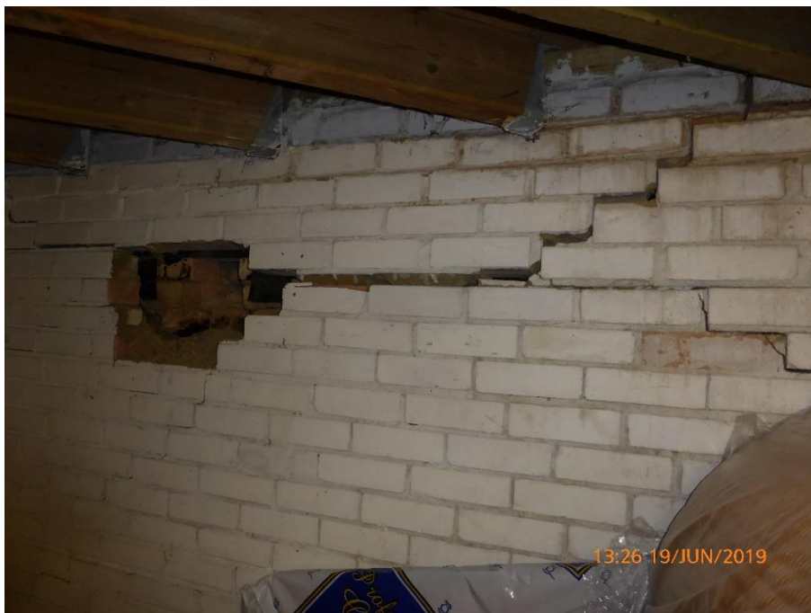
Typical damage to rear wall of garage