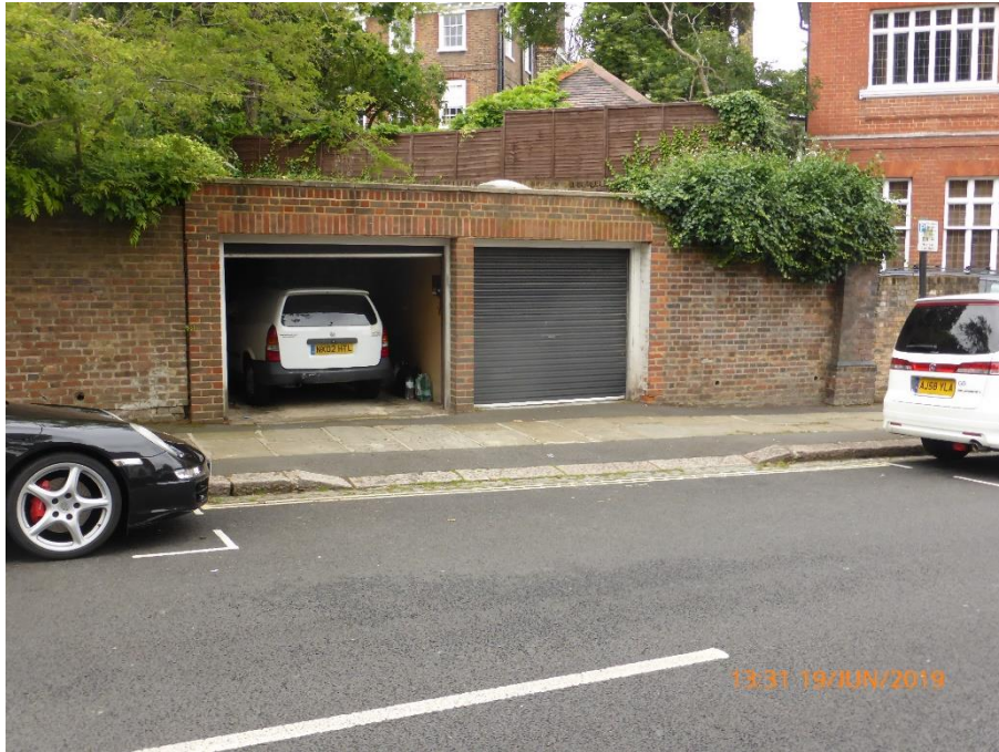
Front of garage