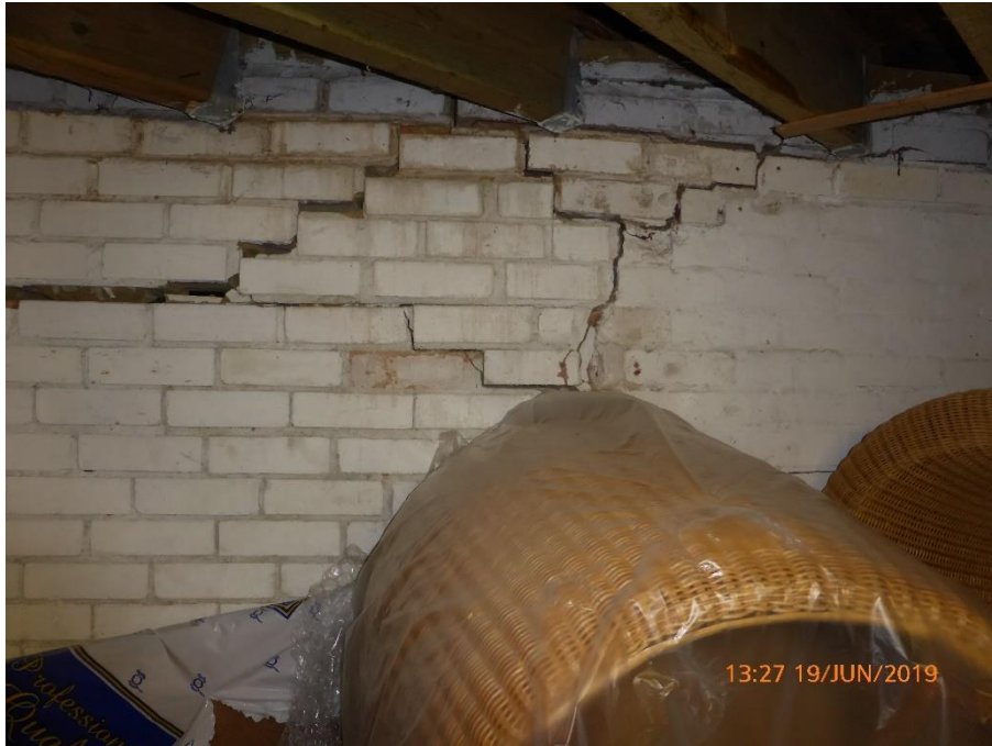
Typical damage to garage