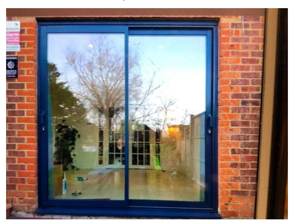
Example reference F1: