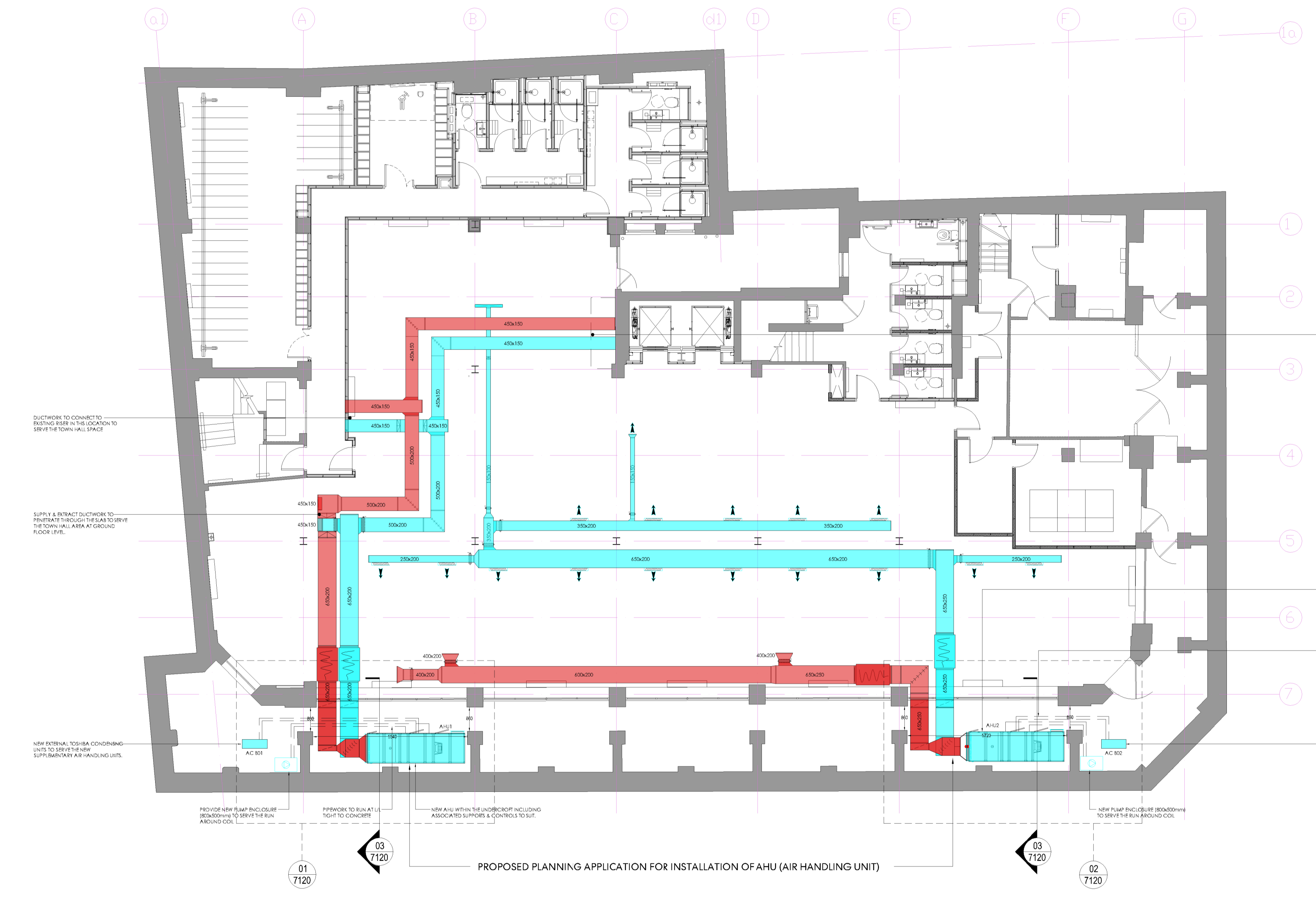
1 PROPOSED GENERAL ARRANGEMENT PLAN - LEVEL B1 1 : 100