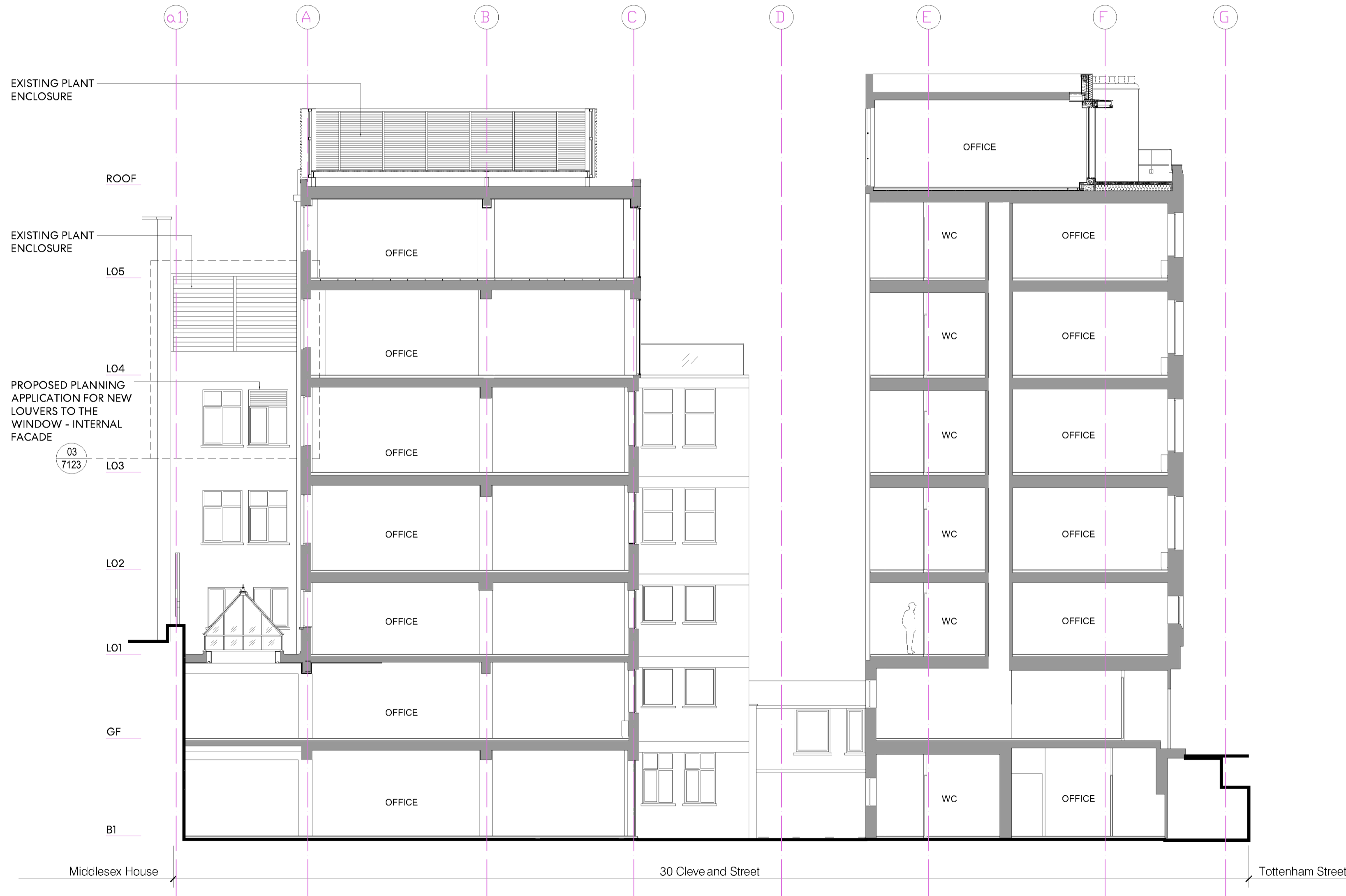
1 PROPOSED SOUTH-WEST INTERNAL ELEVATION 1 : 100