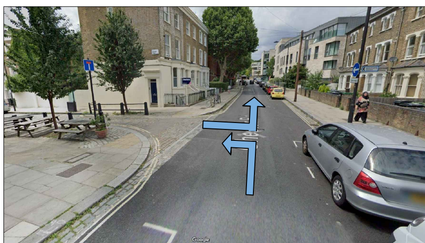
One Way System at Chester Road Showing Junction with Bertram Street