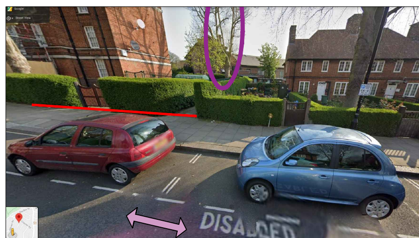
View to site from Croftdown Road - Protected Tree Circled

Drawing D15 Image Views FARRANS CONSTRUCTION Camden Highgate Newton