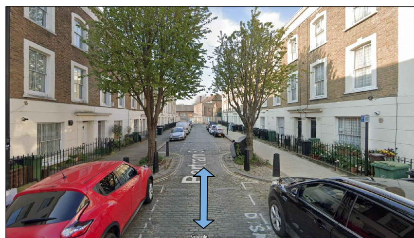
View from Bertram Street Looking to Site Entrance