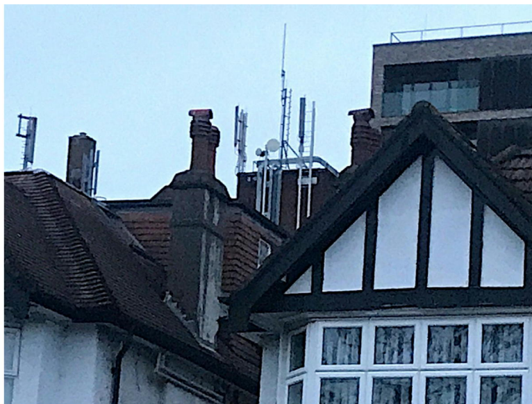
Fig 3. View of the Telephone Exchange from Alvanley Gdns.