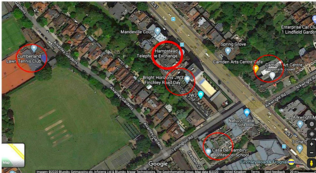
Fig 1. Schools and Nurseries near the Telephone Exchange.

"(1) Each local authority must take such steps as it considers appropriate for improving the health of the people in its area."