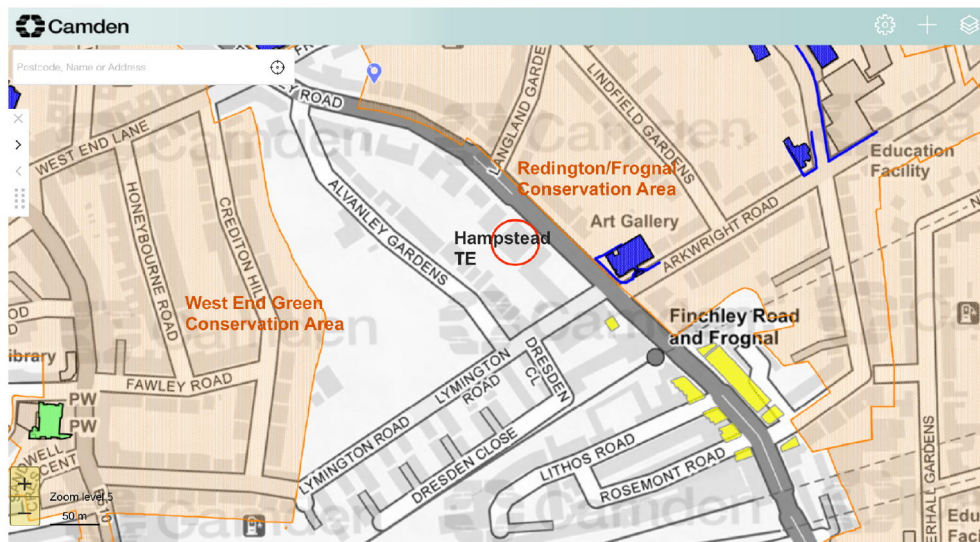
Fig 5. Adjoining Conservation Areas

For these reasons this application should be refused.