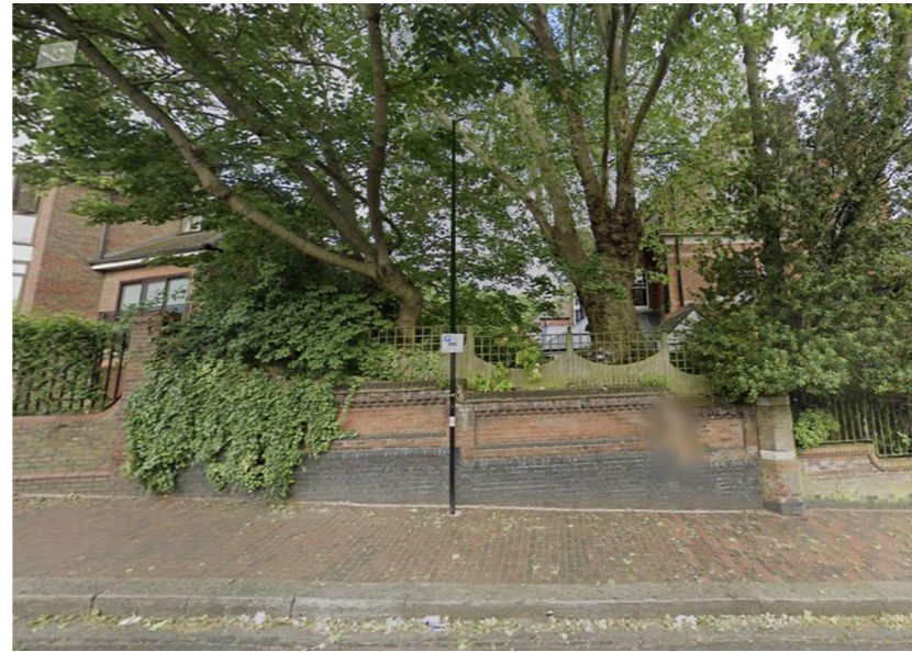
LOCATION A WITH POLE