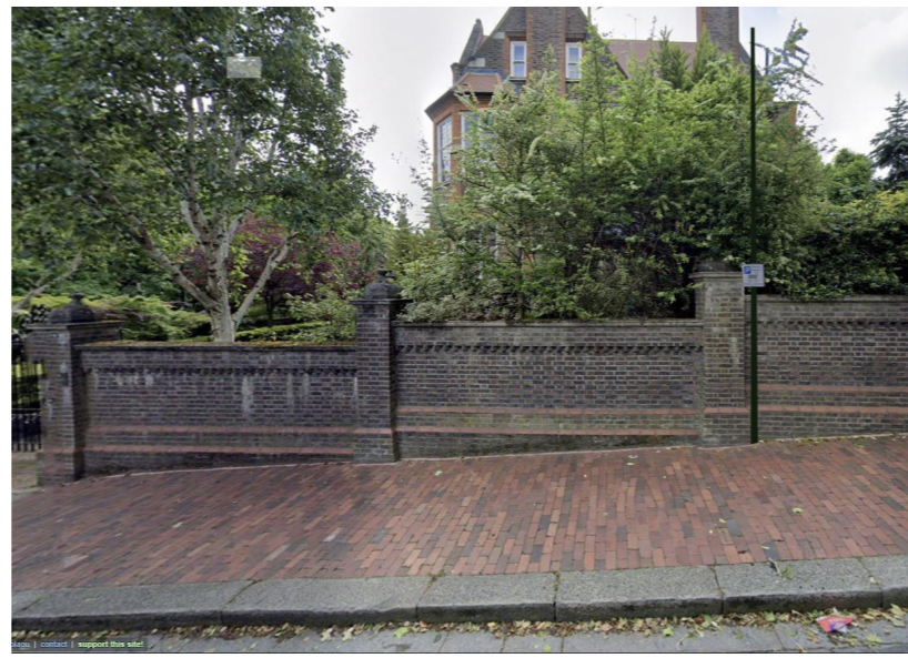
LOCATION B WITH POLE