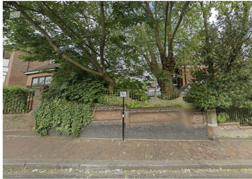
LOCATION A WITHOUT POLE