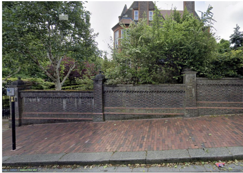
LOCATION B WITHOUT POLE