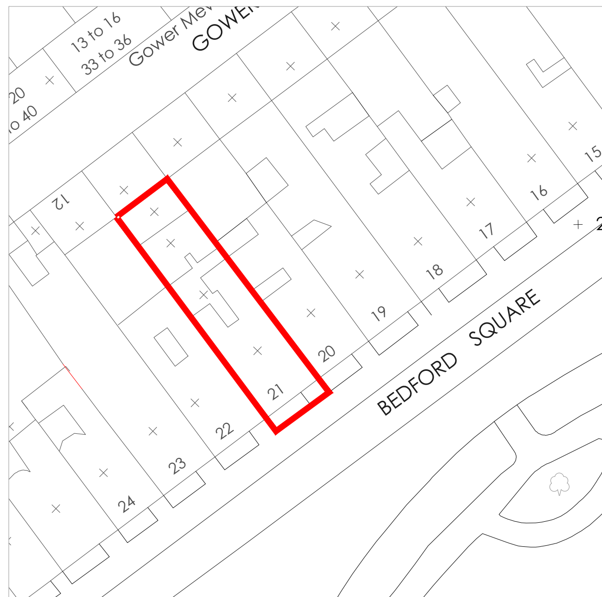
Site Plan Scale 1:500