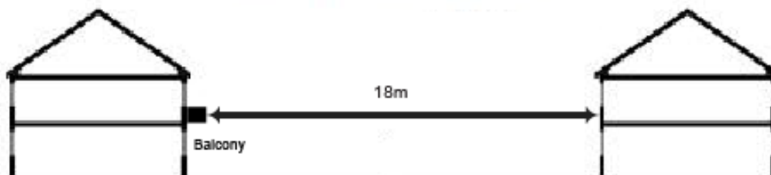
Figure A: 18m separation distance measurement