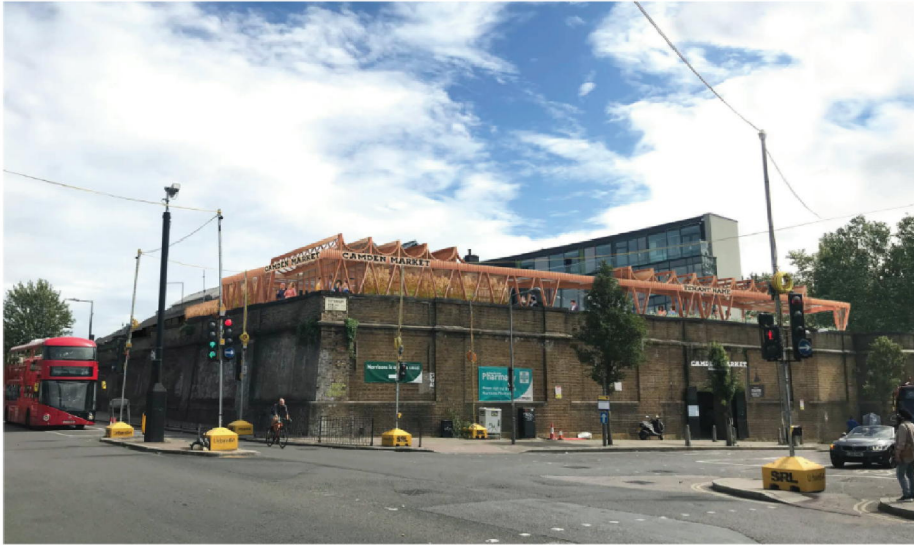
7.7 IMPRESSION FROM CORNER OF CHALK FARM ROAD

This proposal would completely obscure the main building, and make permanent the harm to its heritage quality that are caused by the temporary stall structures. This complete obscuring would cause substantial harm to the setting of this grade II* structure, which harm is not offset by any public benefit from the development.