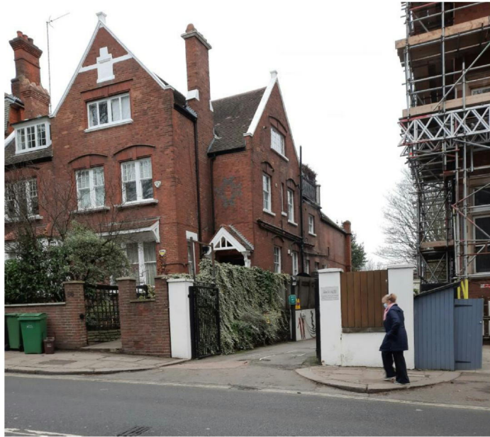
Fitzjohn's Primary (wooden sign appears to be missing)