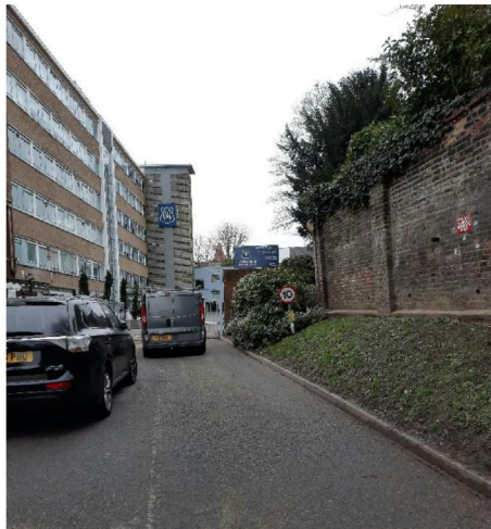
Northbridge House Senior School