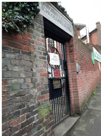
UCS Junior School