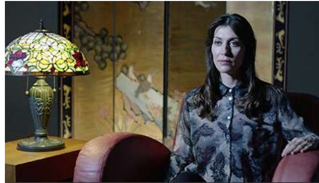
Example of general lighting without filter