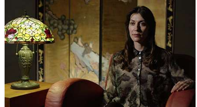
Example of general lighting with filter