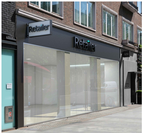
[03] 3D visuals of the proposed new shopfront