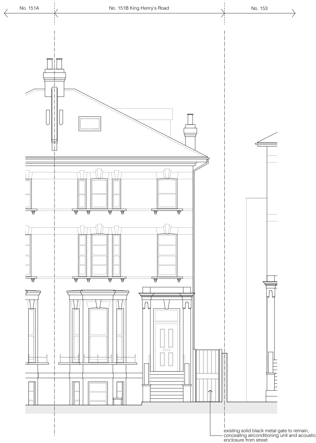
FRONT ELEVATION: PROPOSED