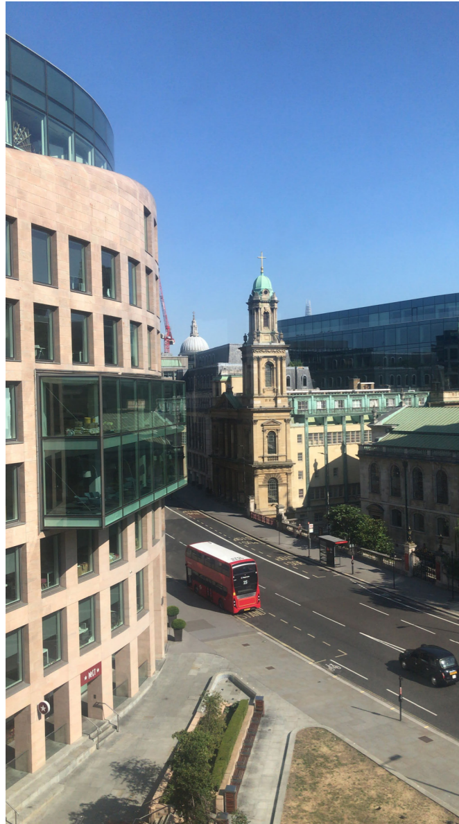
Cantilevered glass balconies on Charterhouse street