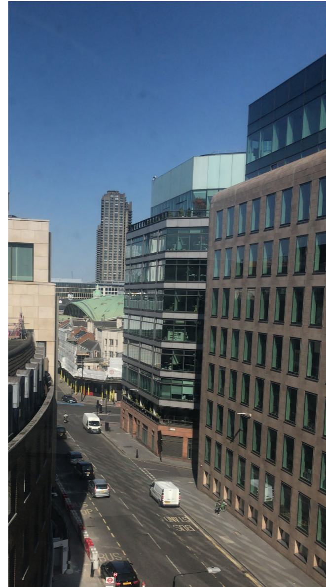
Glazed offices on Shoe lane Farringdon