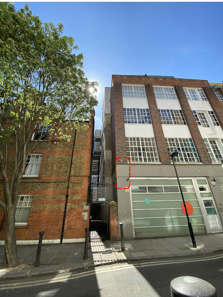
Existing Photo - Photo taken from Macklin Street, highlighted area is the proposed location for new signage