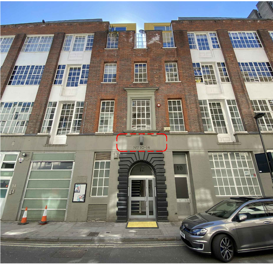
Existing Photo - Photo taken from Macklin Street, highlighted area is the proposed location for new signage