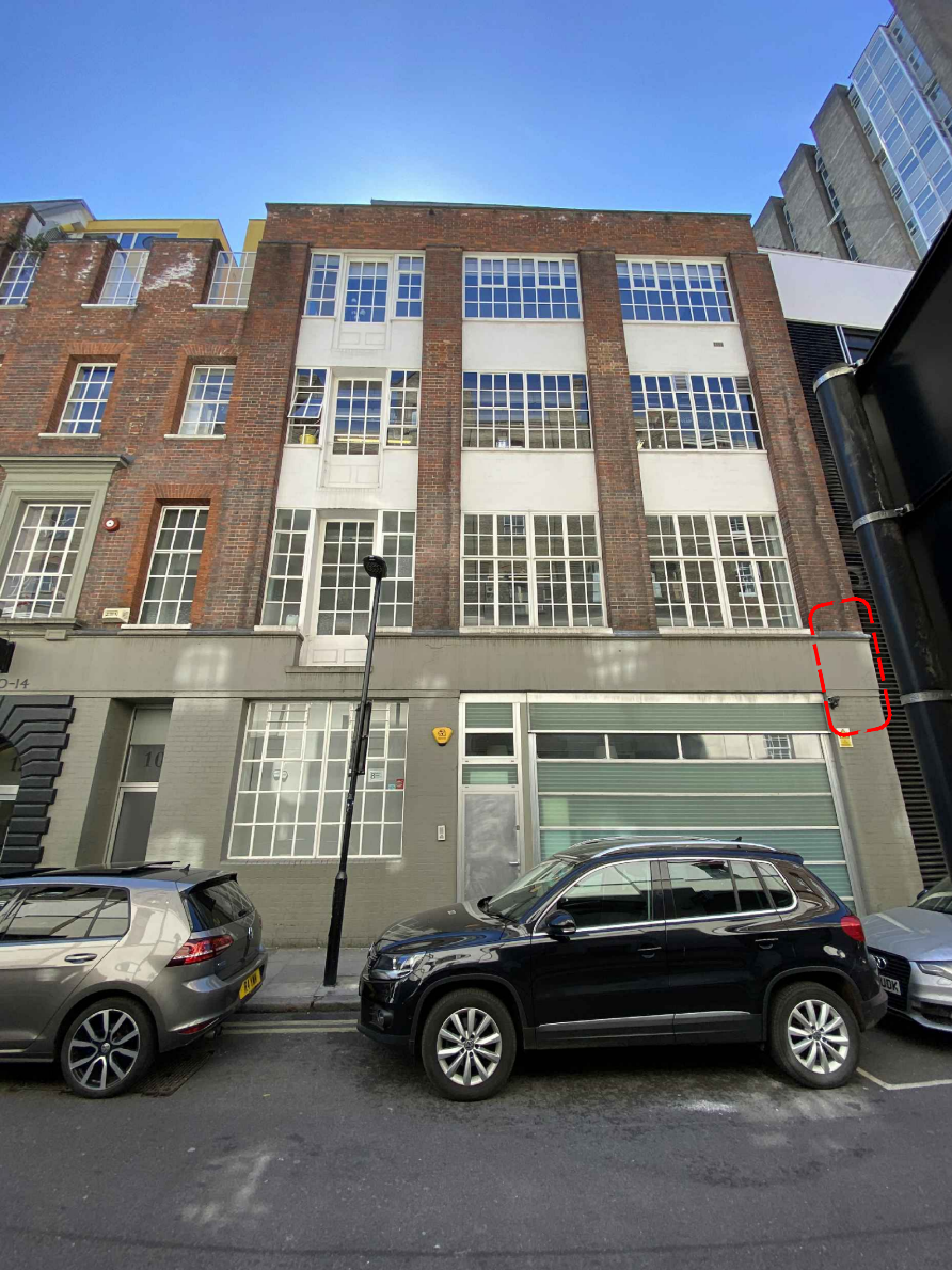
Existing Photo - Photo taken from Macklin Street, highlighted area is the proposed location for new signage