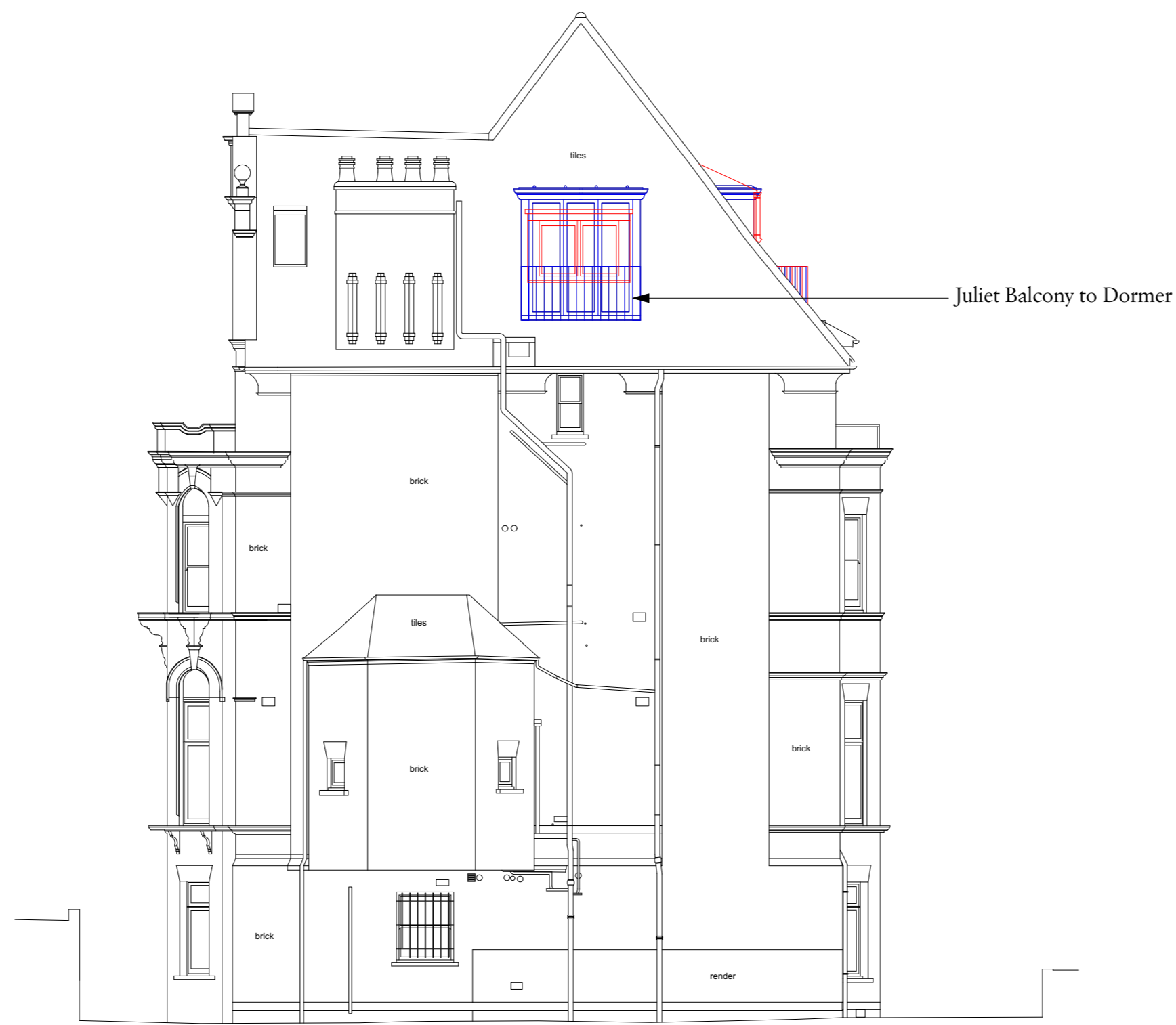
38 Comparison Existing Design Proposed Design