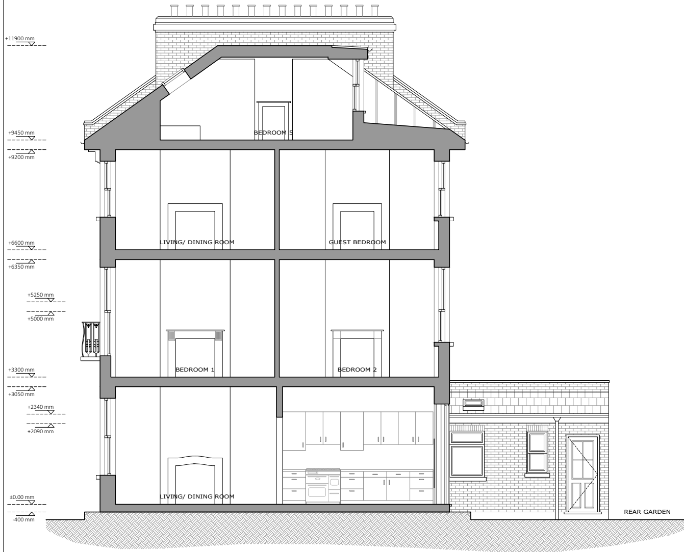
EXISTING SECTION BB