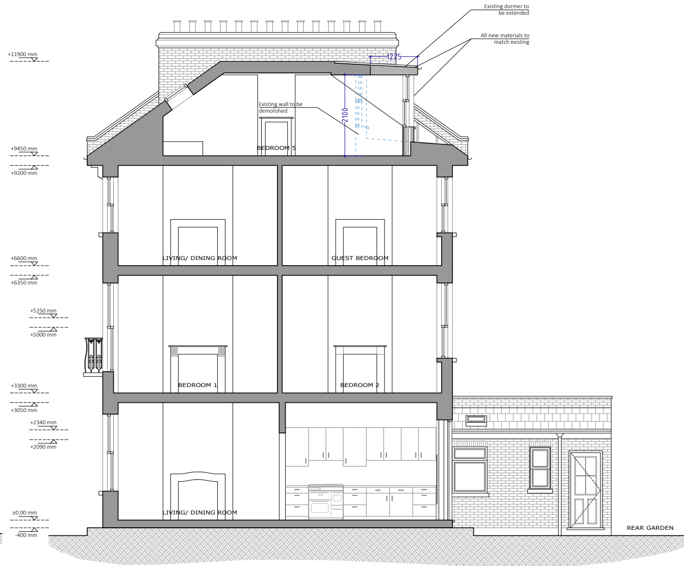
PROPOSED SECTION BB