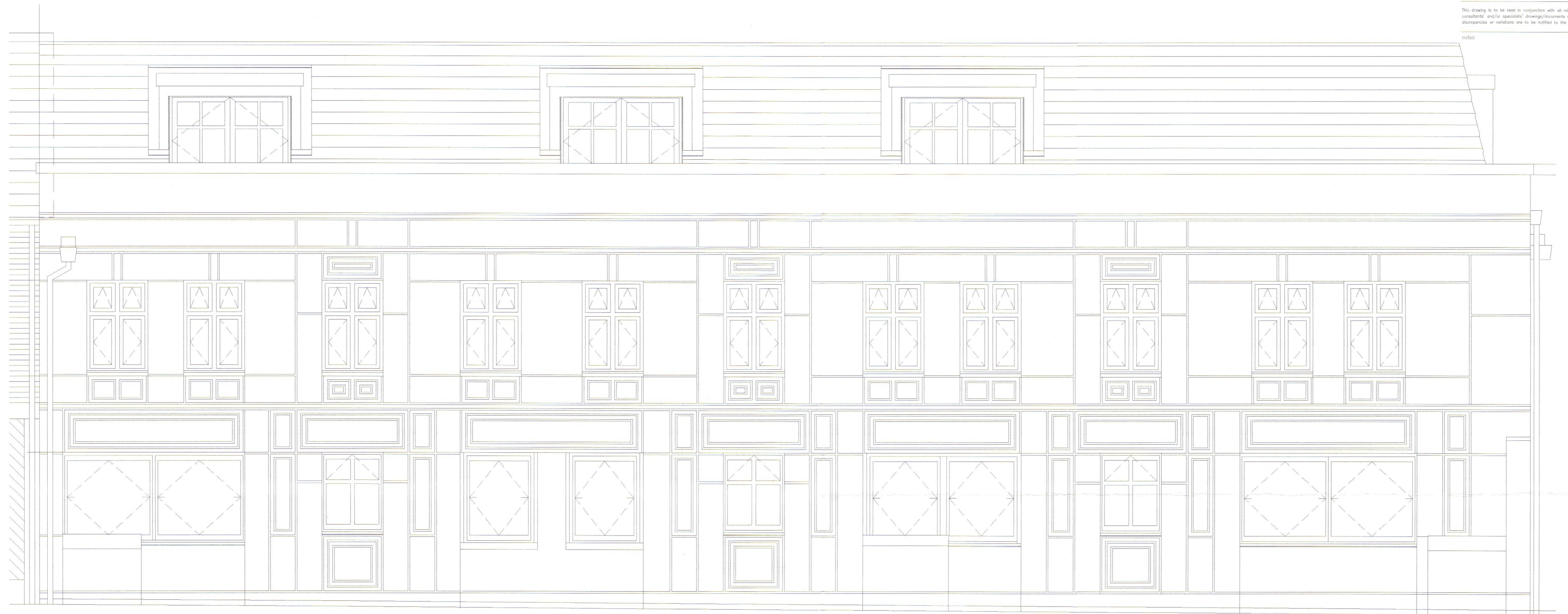
RENDER BANDS SET OUT IN ACCORDANCE WITH ELEVATION DRAWING No. 300.A