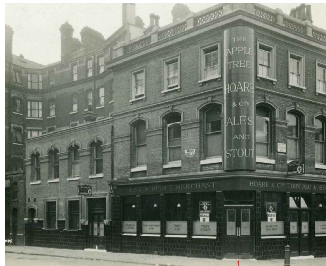
Historic Photograph of 1933-34 (extract from Heritage Statement)

Report any discrepancies in writing to Palmer Lunn Architects before proceeding.