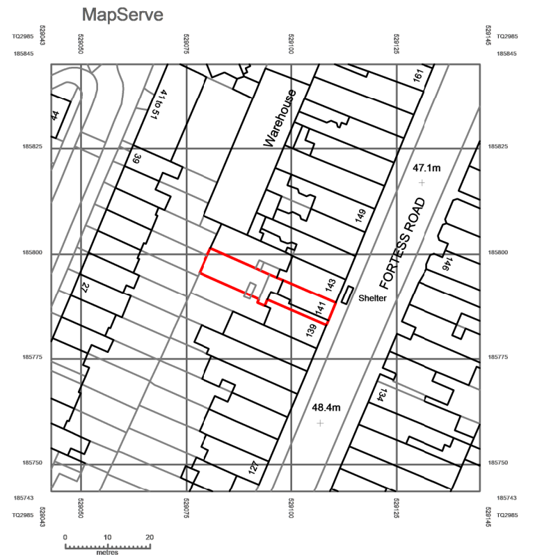
LOCATION PLAN 1 : 1250 @A3