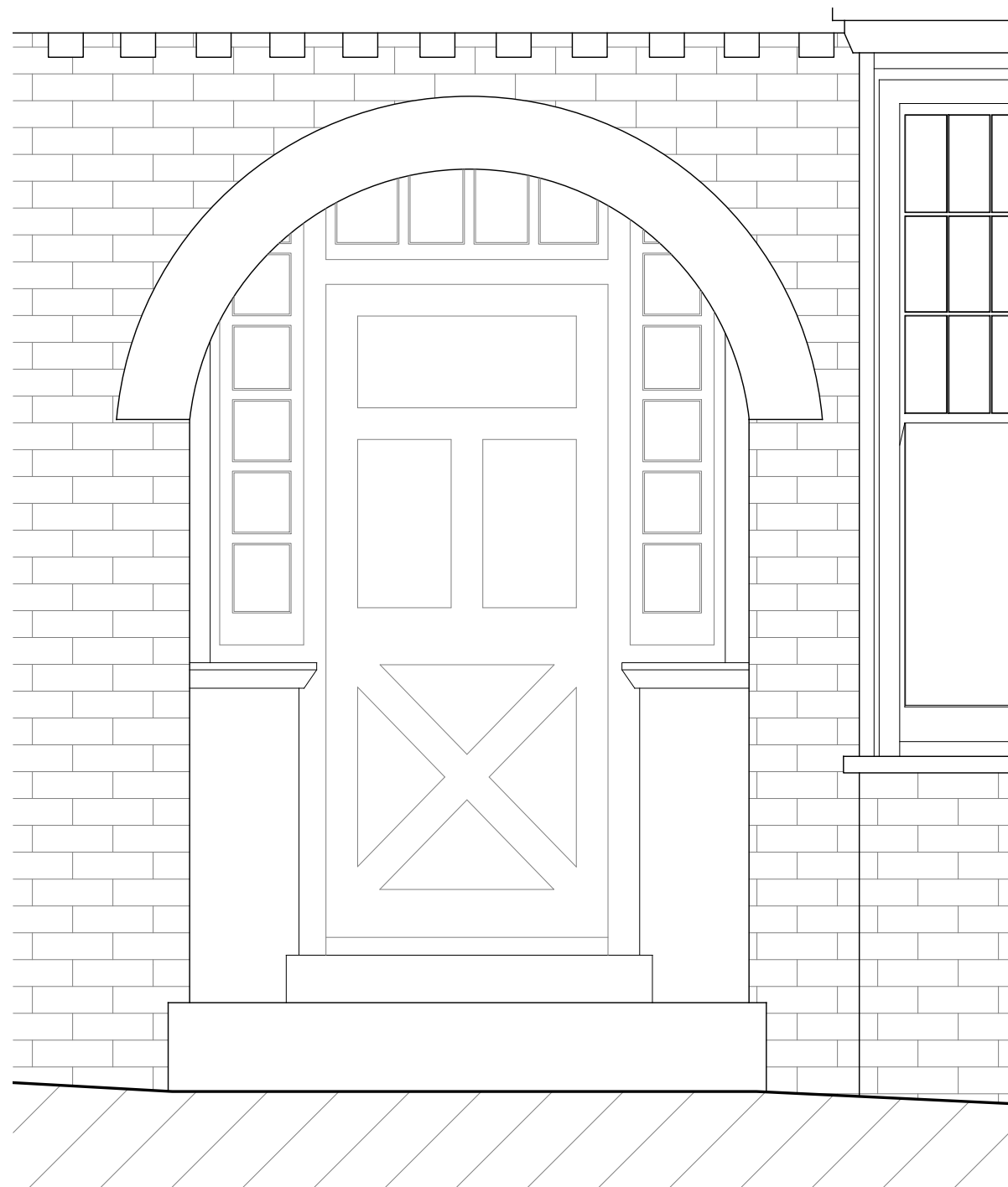
EXISTING Front Door SCALE 1:20@A3