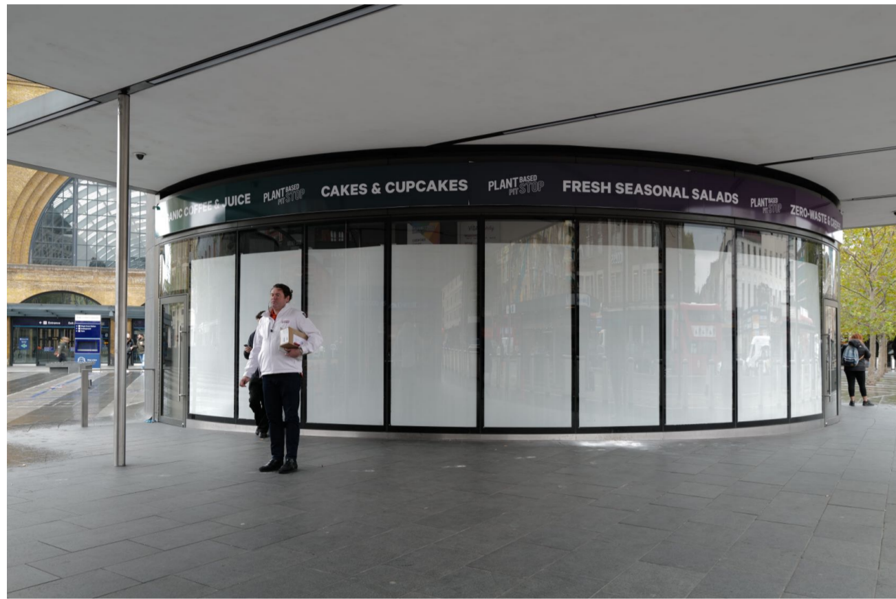
View to shopfront