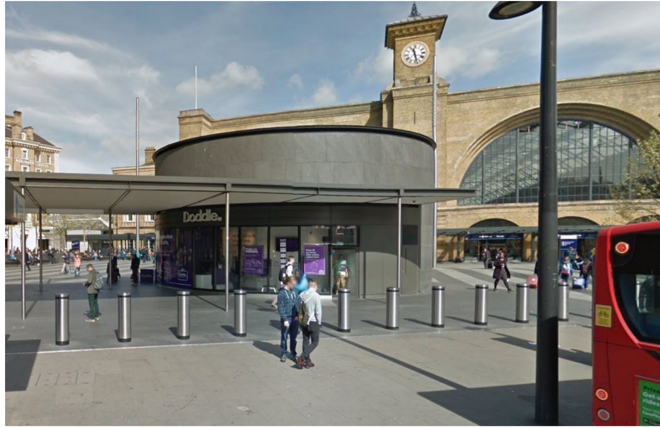
View to unit from Euston Road