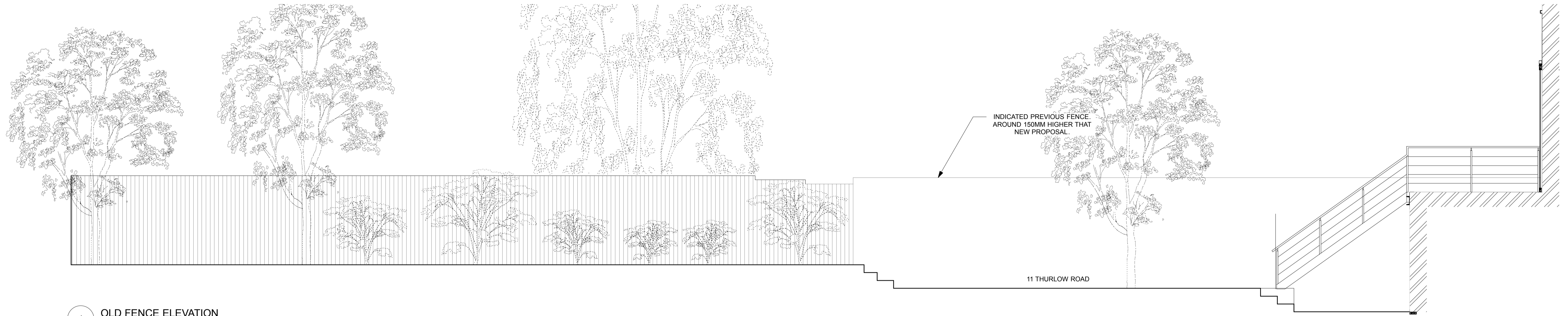
1 OLD FENCE ELEVATION Scale: 1:50