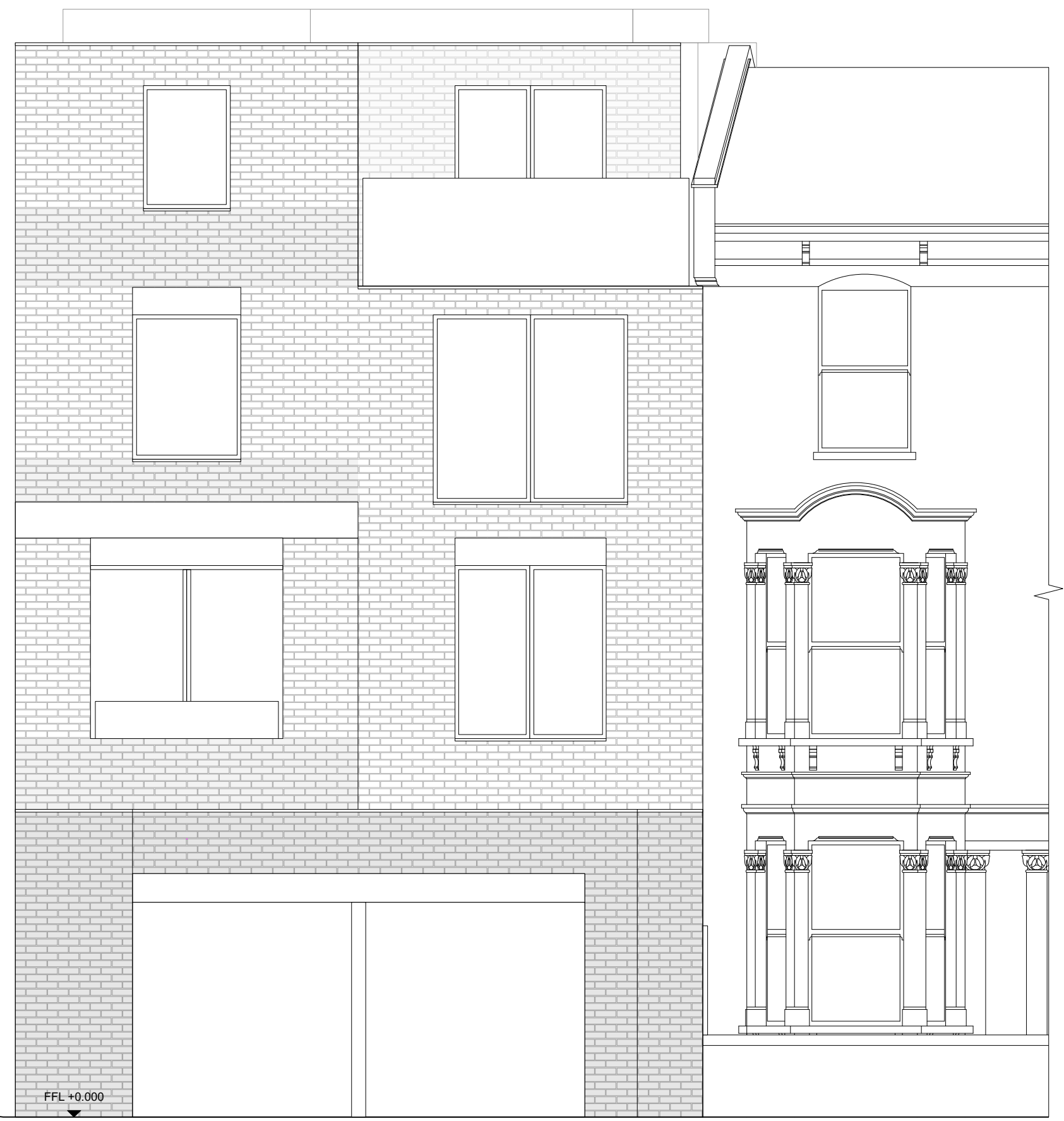
1 PROPOSED SIDE ELEVATION 1:50@A3

FRL +11.600 ▼ FRL +11.250 ▼ FRL +8.700 ▼ FRL +6.440 ▼ FRL +3.225 ▼ FFL +0.000 ▼