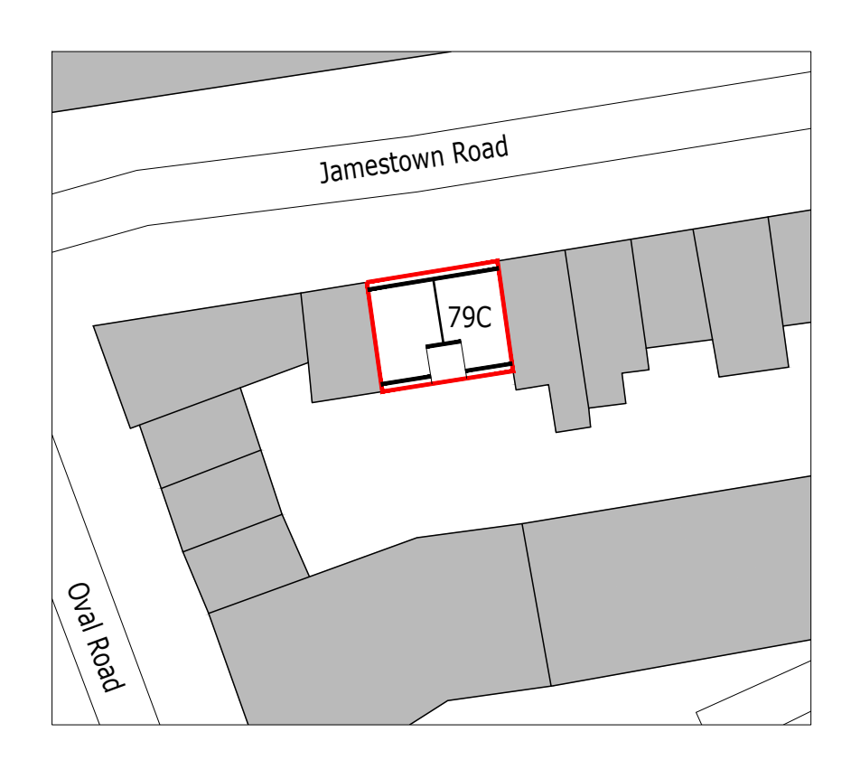
Block Plan-Proposed Scale 1:500